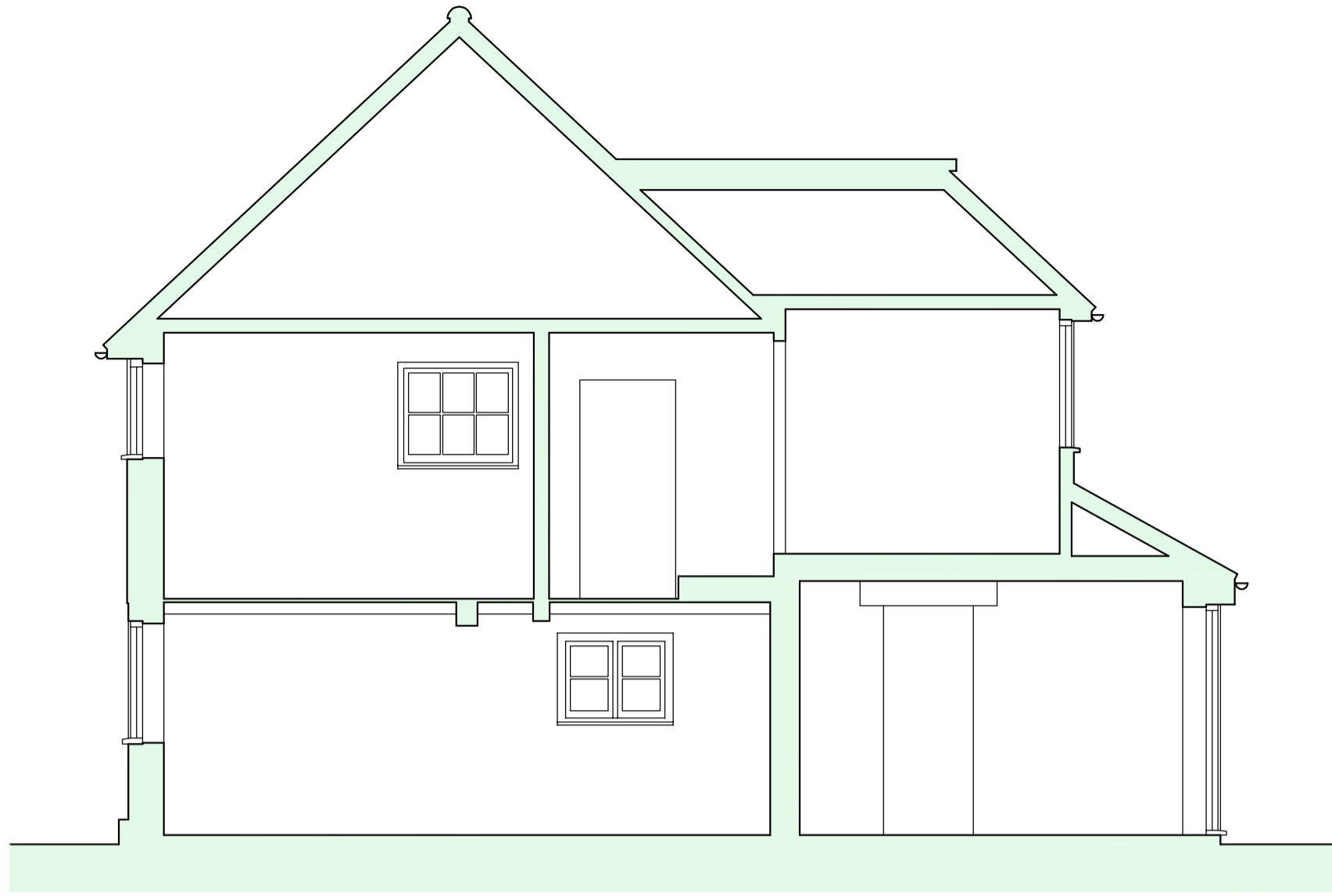
SECTION: SECTION-ELEVATION A-A (1:50)