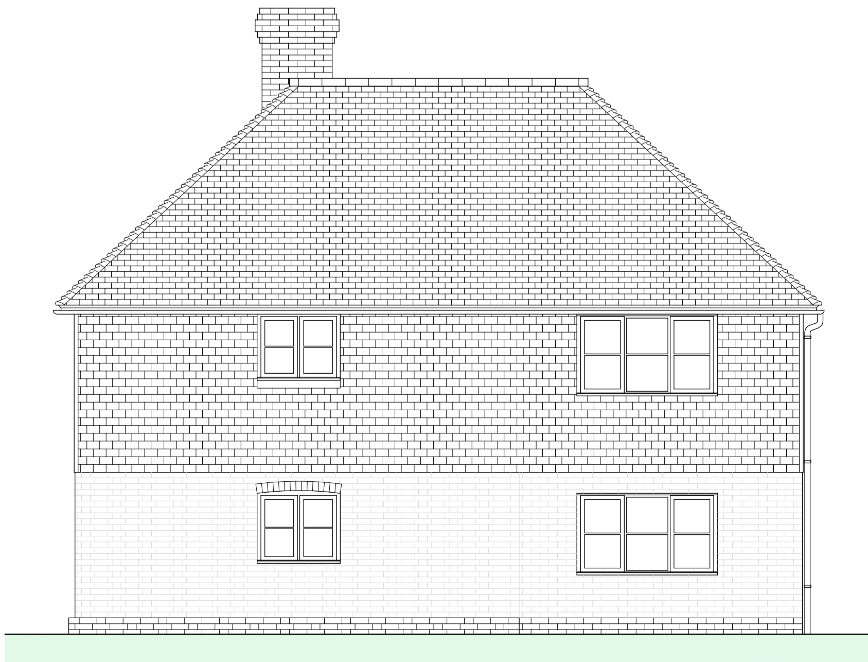
SURVEY: SOUTH-WEST ELEVATION (1:50)