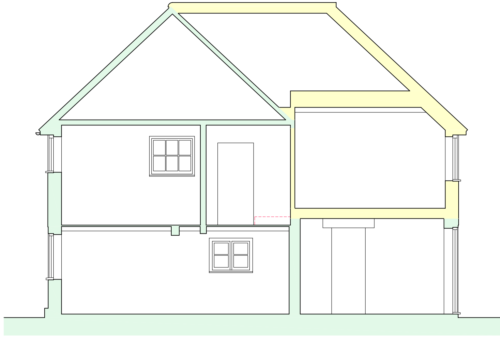
PROPOSED: SECTION-ELEVATION A-A (1:50)