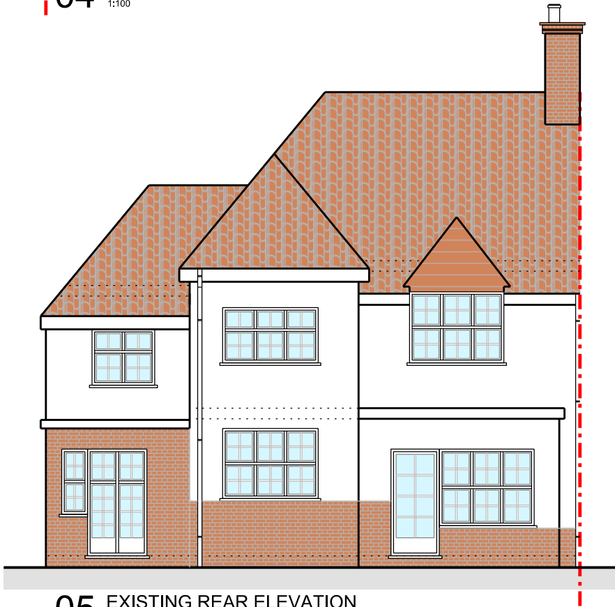
05 EXISTING REAR ELEVATION 1:100

Disclaimer: Do not scale from this drawing. Check all dimensions on site before fabrication or setting out. This document is copyright and may not be reproduced without permission of the owner. Notes: All dimensions in millimeters. KEY: