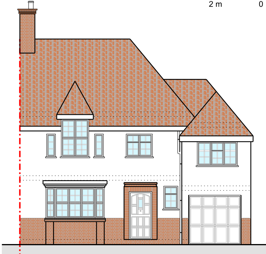
04 EXISTING FRONT ELEVATION 1:100