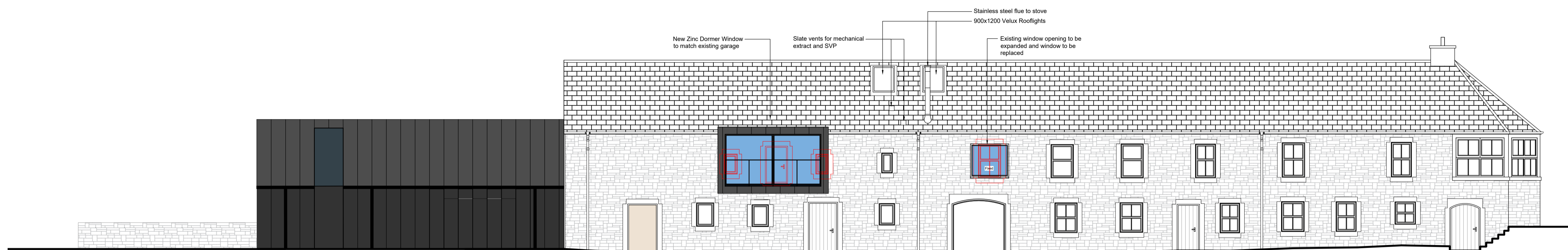
1 Proposed North-West Elevation 1:100 @A1