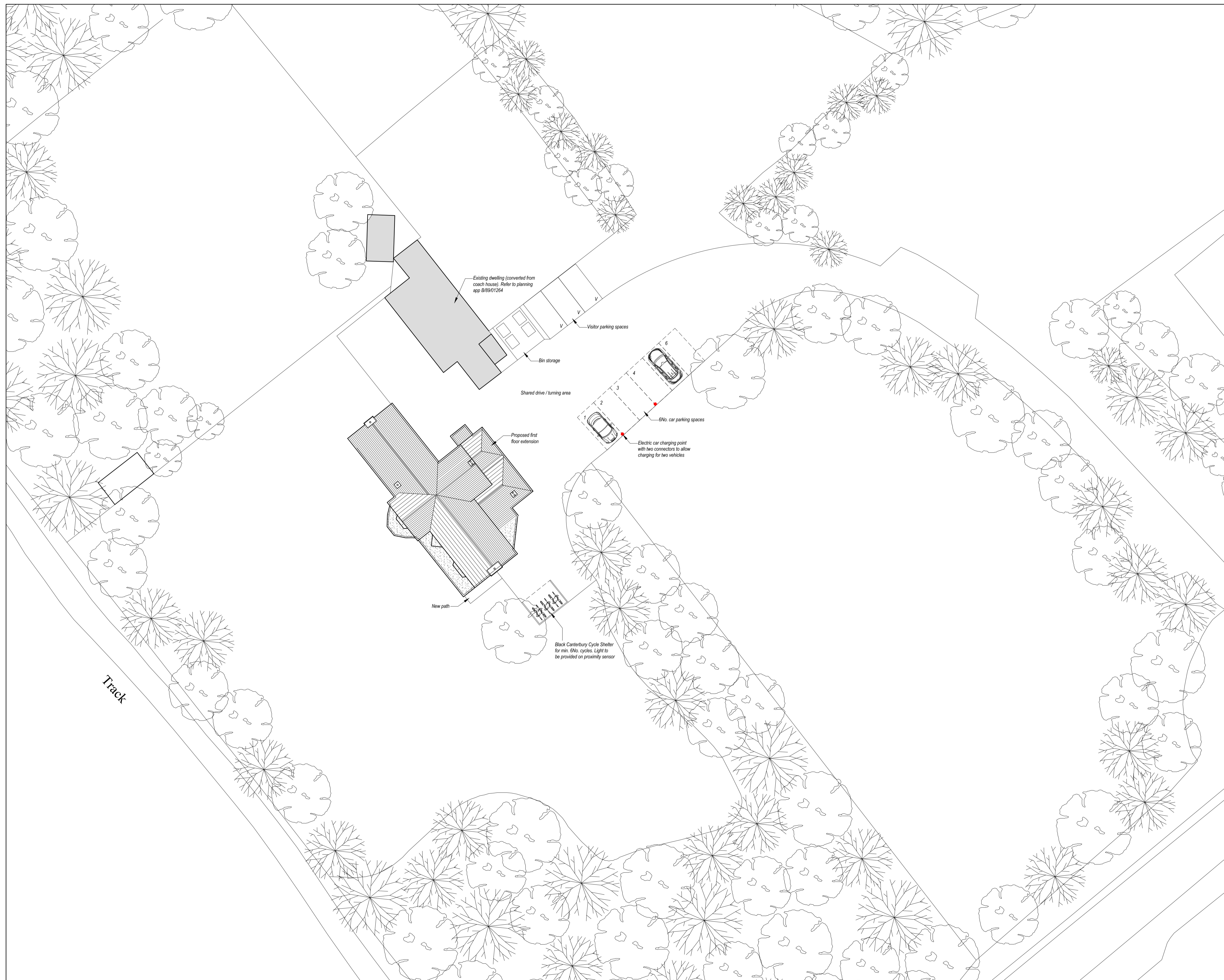
Proposed Site Plan Scale: 1:200