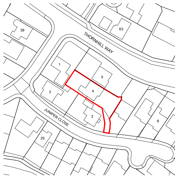
Site Location Plan Ordnance Survey 100053143