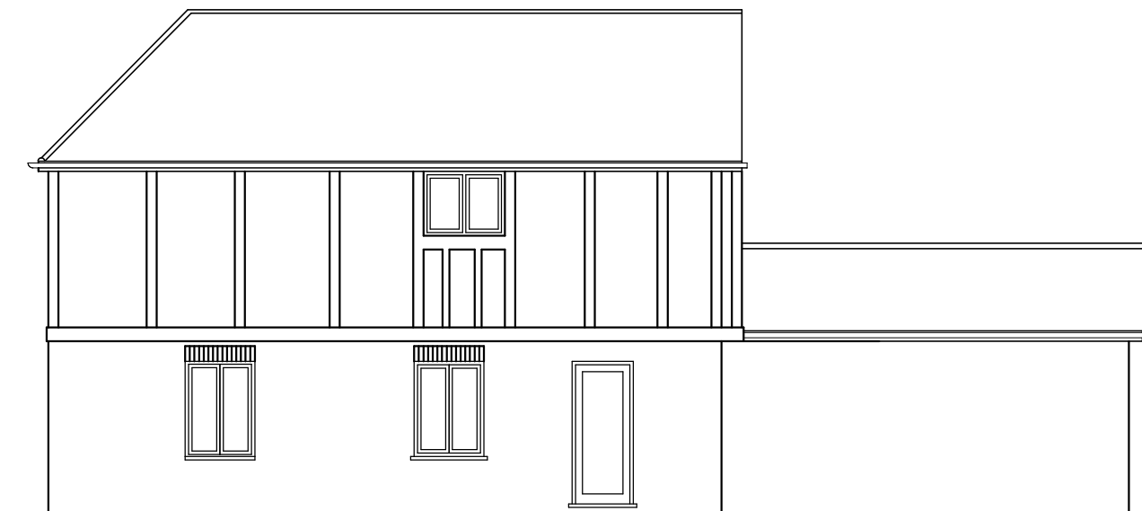
AS-BUILT / PROPOSED RIGHT SIDE ELEVATION (NORTH-FACING)

dark grey aluminium frame casement replacement windows on side elevation