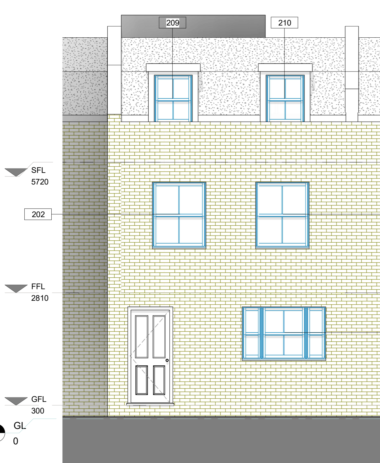
FRONT Elevation Proposed 1 : 50

NB:- WINDOWS TO BE REPLACED HIGHLIGHTED IN BLUE