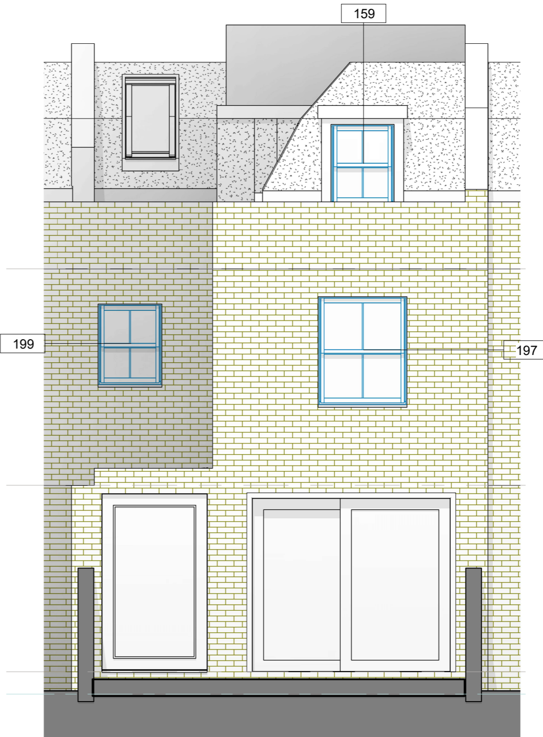
REAR Elevation Proposed 1 : 50