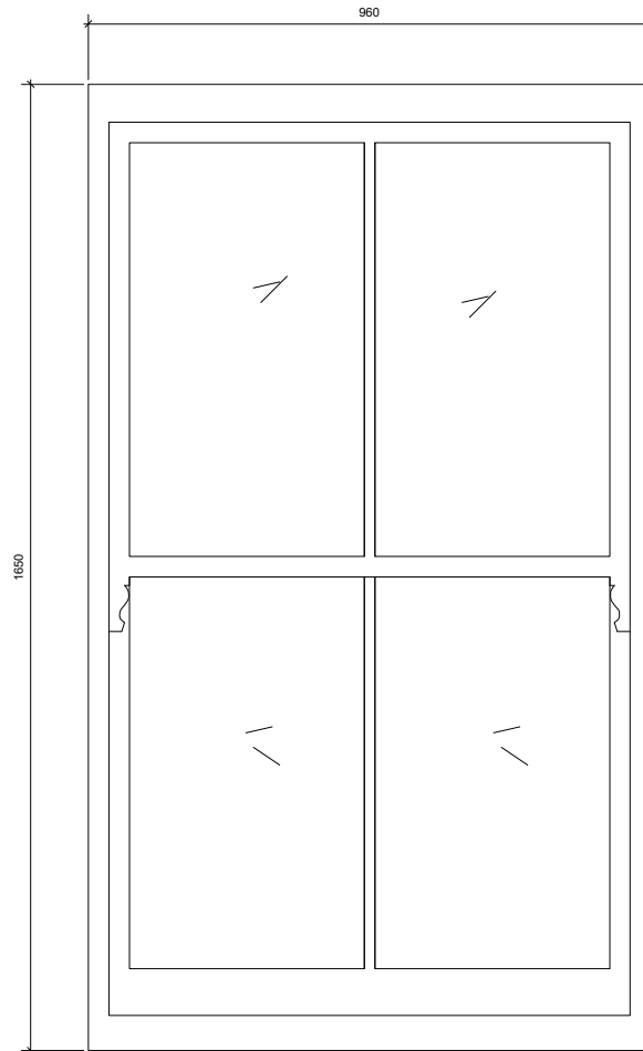
Window B Elevation 1:5 @A1, 1:10@A3