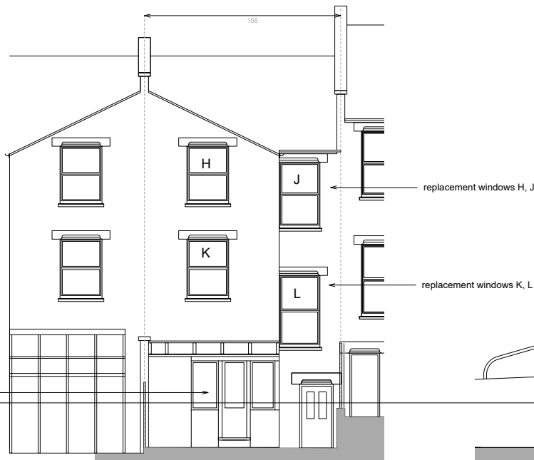
Proposed Rear (West) 1:50@A1, 1:100@A3