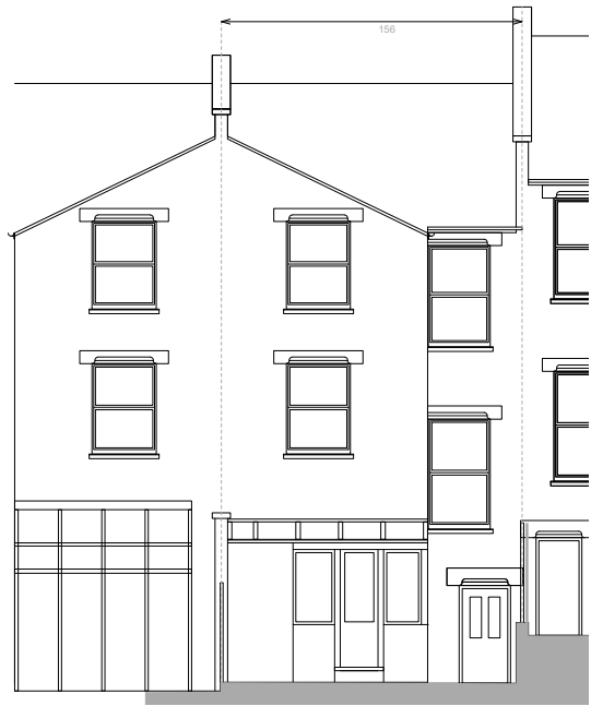
Existing Rear (West) 1:50@A1, 1:100@A3