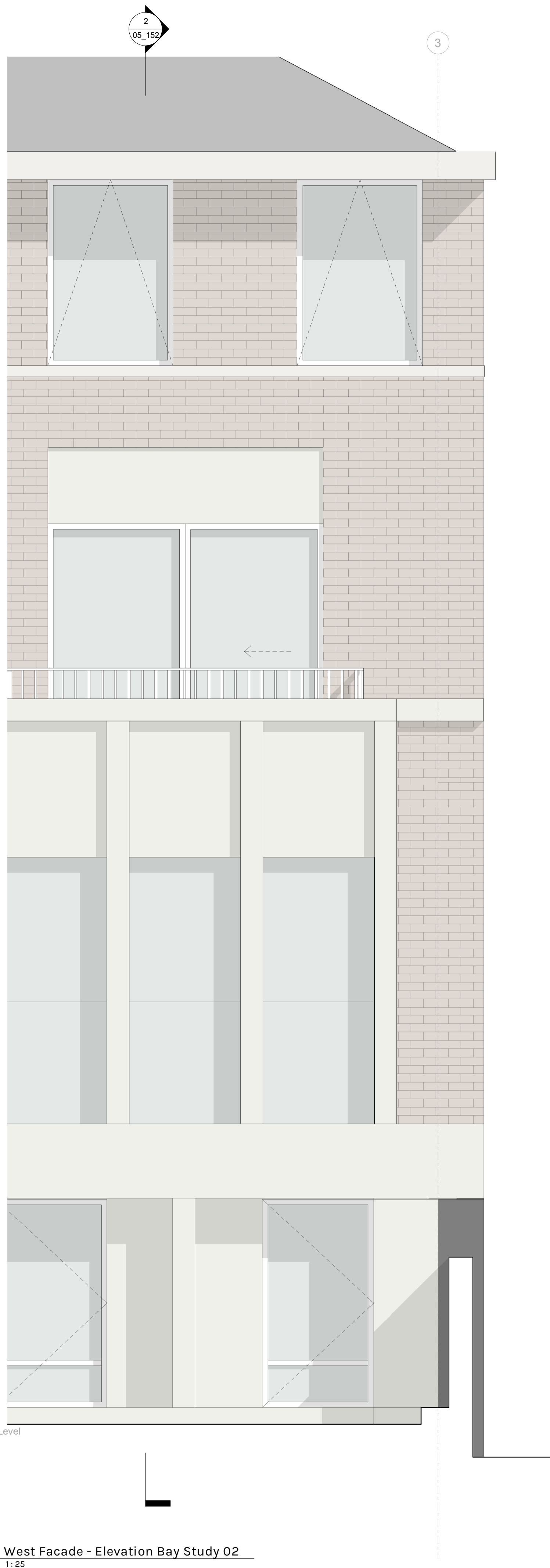
West Facade - Elevation Bay Study 02 1:25

Downen Farmer Architects Ltd is incorporated in England & Wales. Company registration number 10861309.