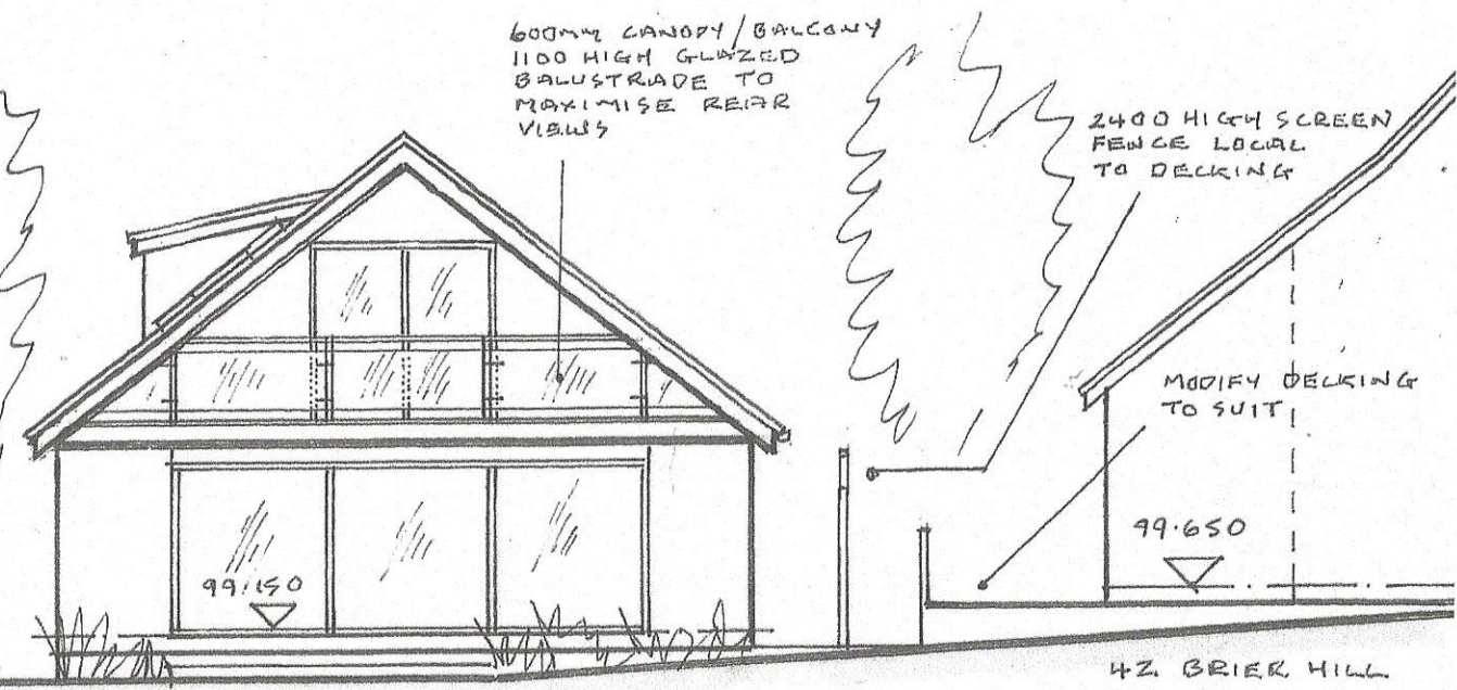
REAR ELEVATION - EAST