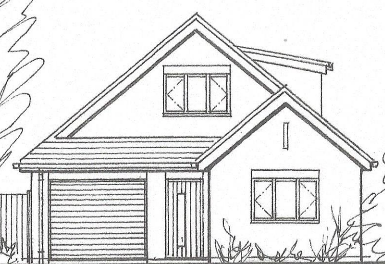
FRONT ELEVATION TO BRIER HILL WEST

6800 MM PLAIN ROOF TILING FACING BRICKWORK WITH BRICK ON EDGE DETAILS PRE-FINISHED TIMBER WINDOWS + DOORS