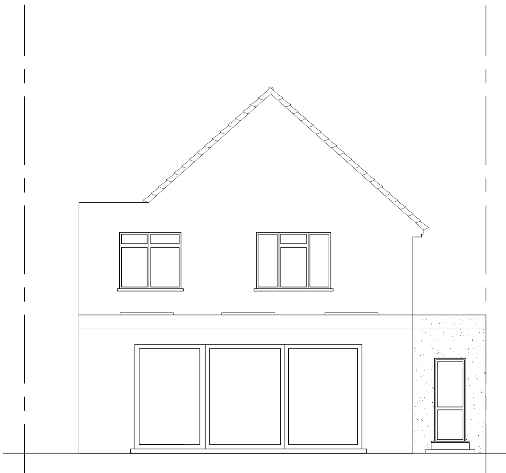
Proposed Rear Elevation Scale 1 : 50