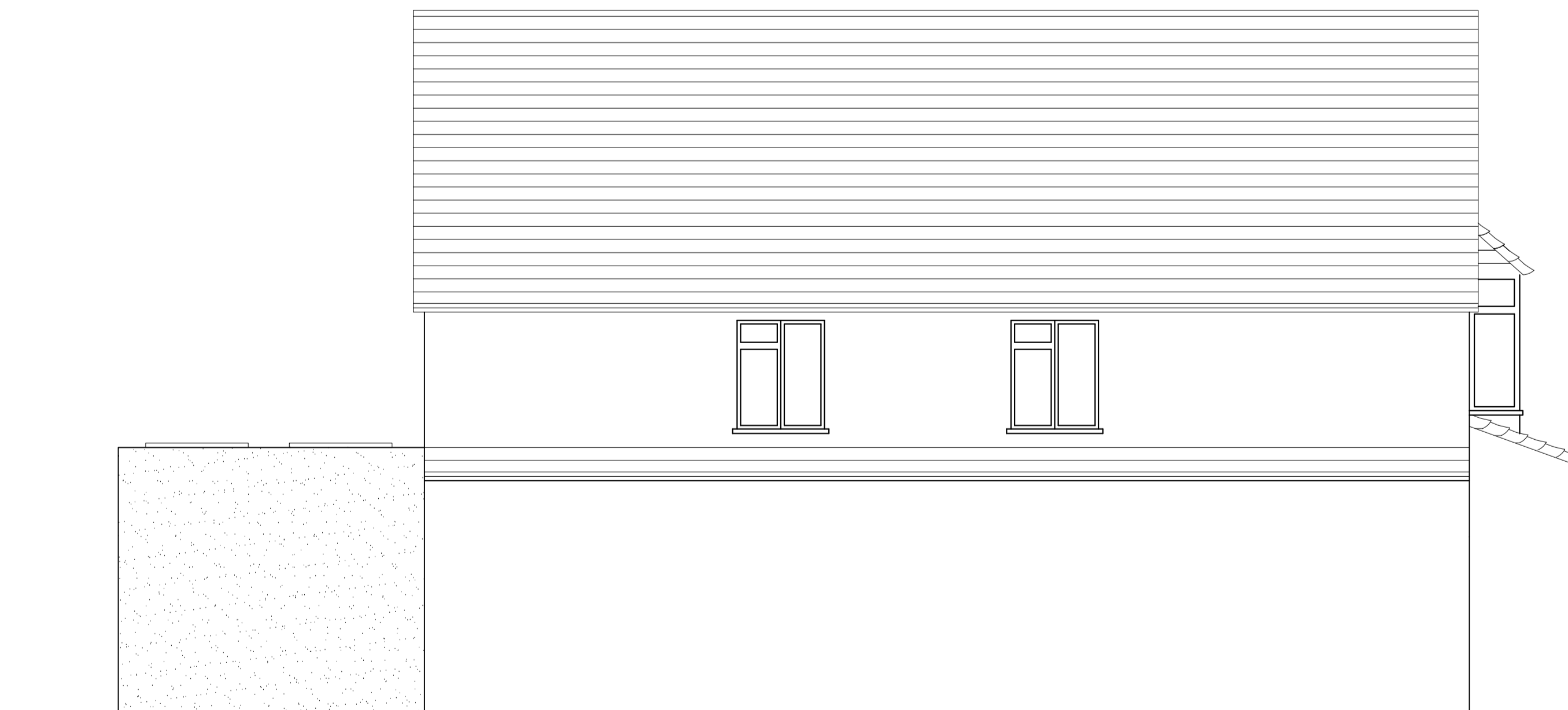
Proposed Side Elevation Scale 1 : 50