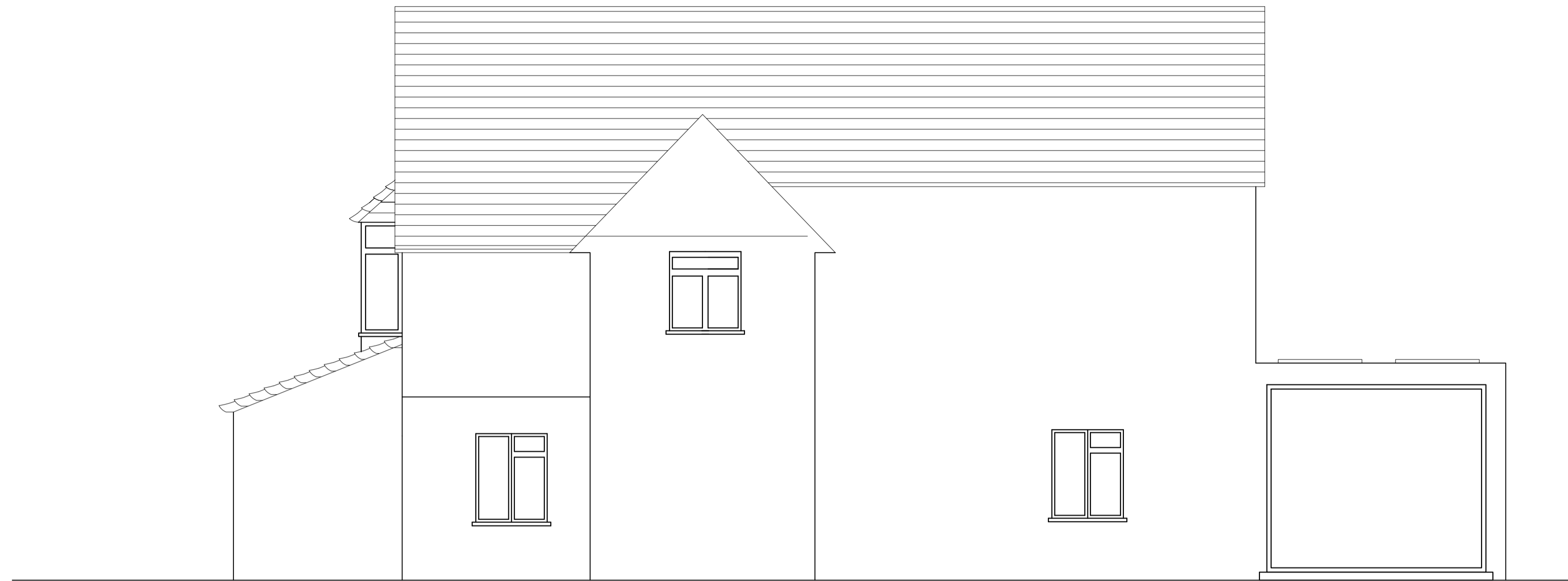
Proposed Side Elevation Scale 1 : 50