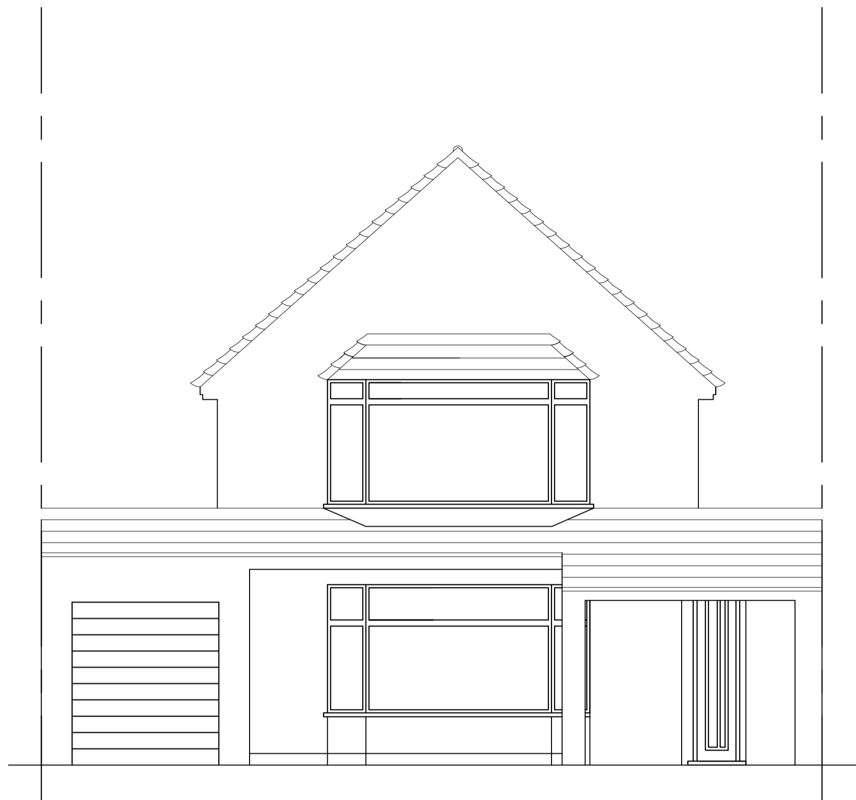
Proposed Front Elevation Scale 1 : 50