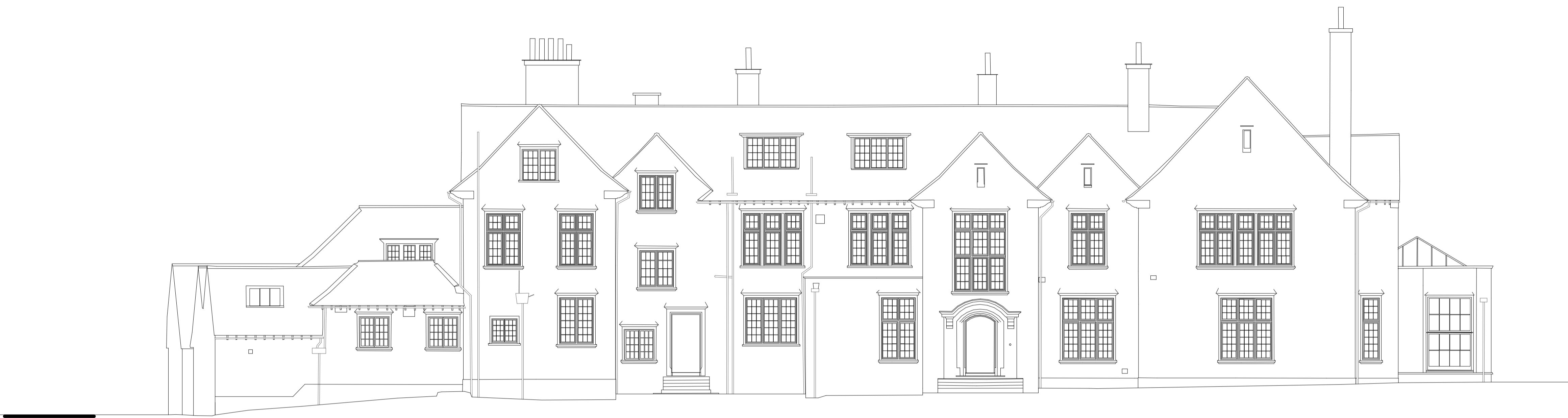
1 Existing North West Elevation 1 : 100