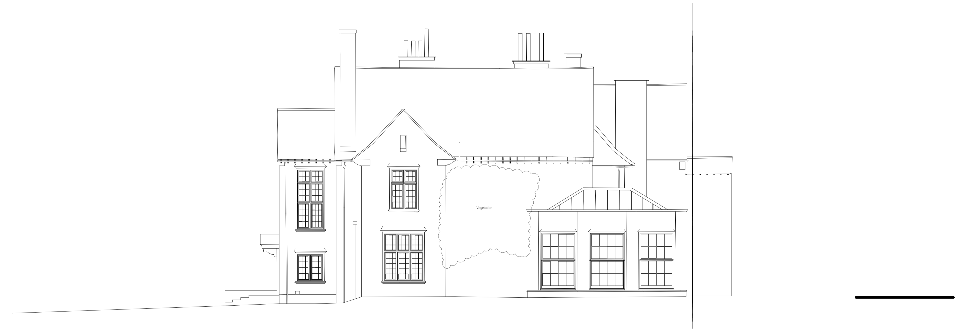
2 Existing South West Elevation 1 : 100