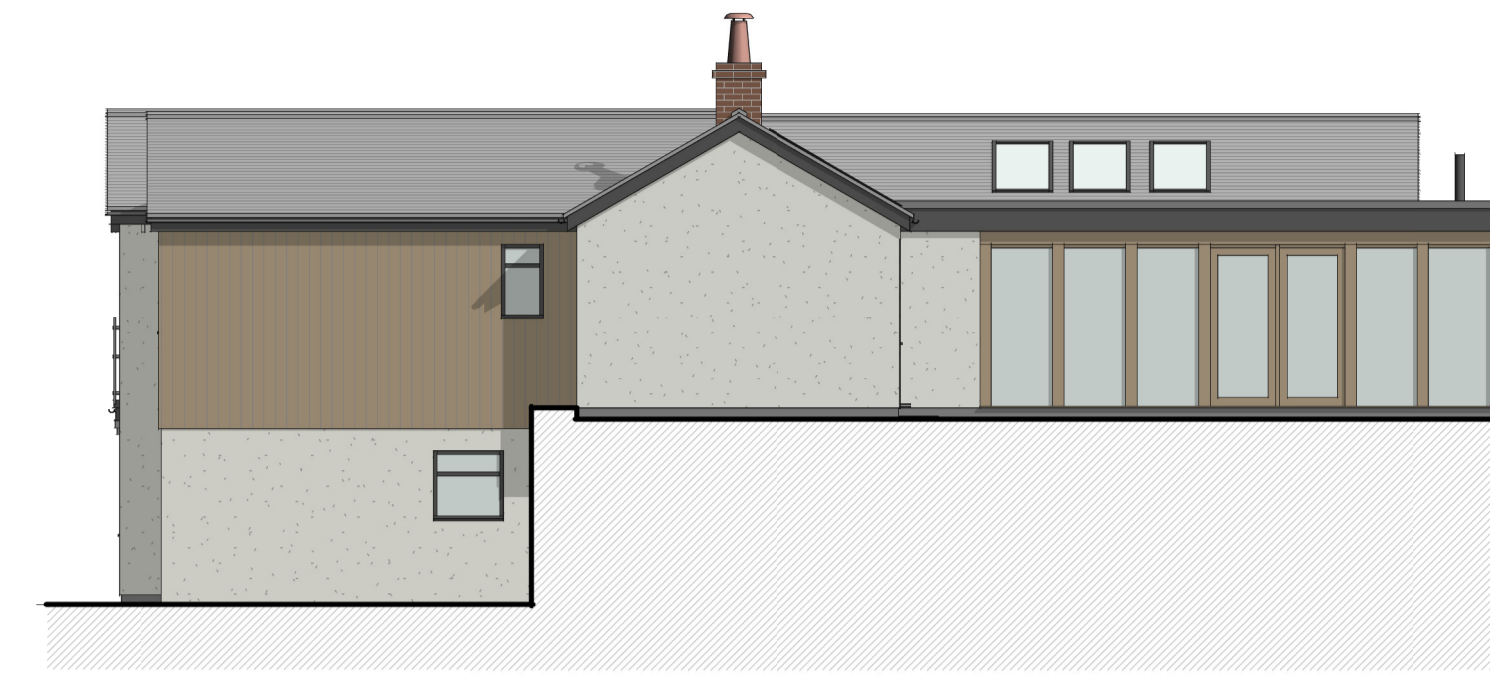
SIDE ELEVATION - South West - Scale 1:100