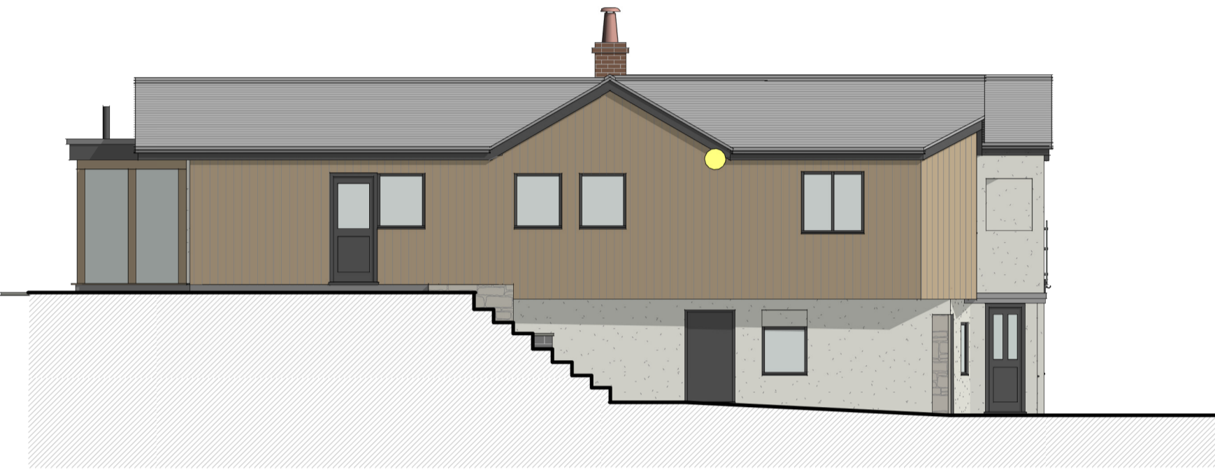
SIDE ELEVATION - North East - Scale 1:100