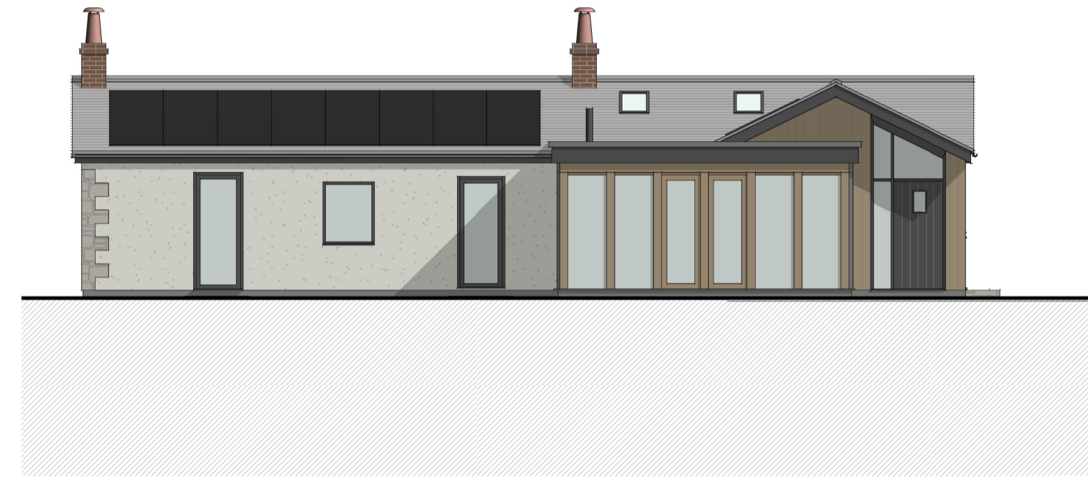
REAR ELEVATION - South East - Scale 1:100