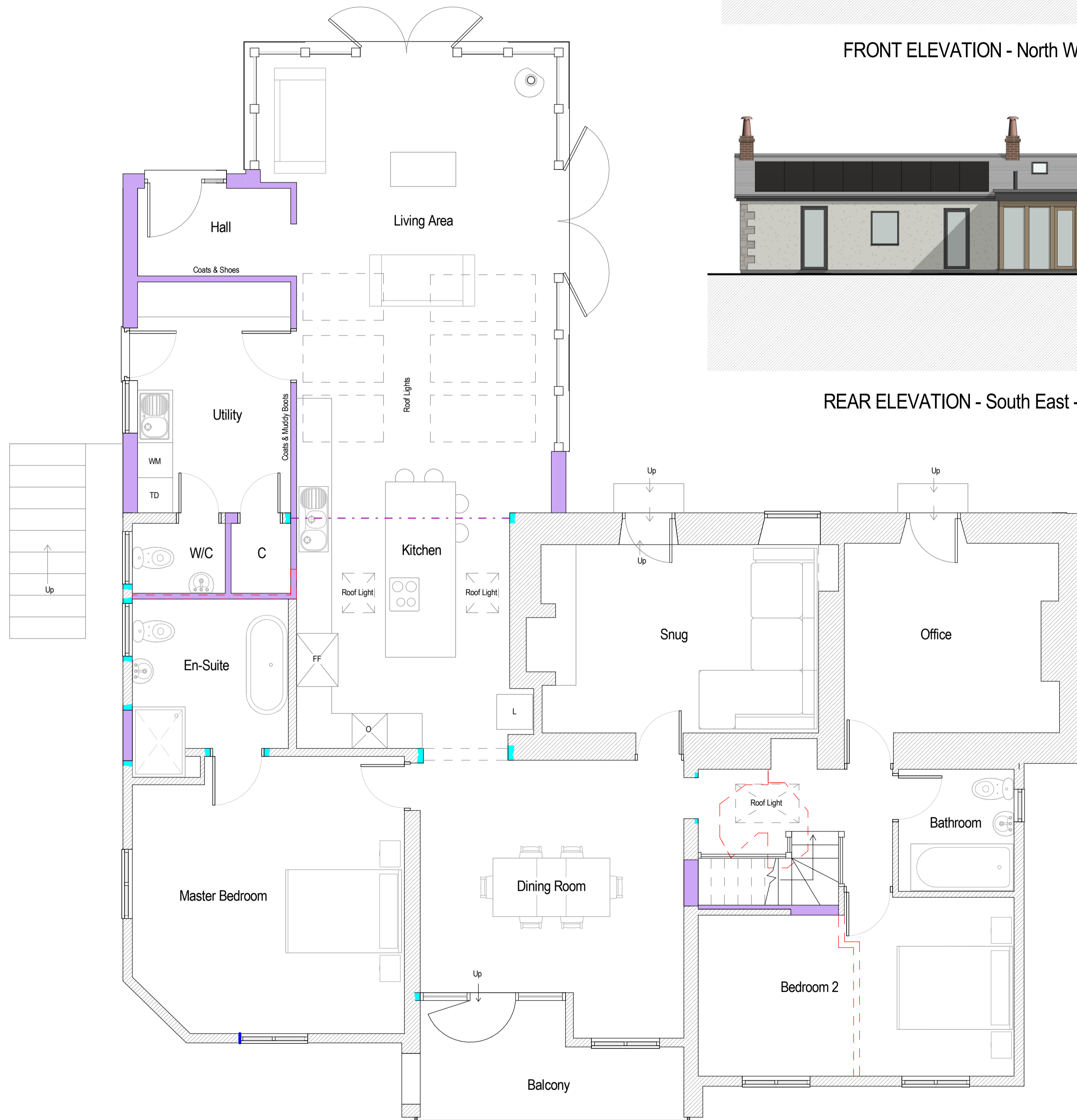
GROUND FLOOR PLAN - Scale 1:50