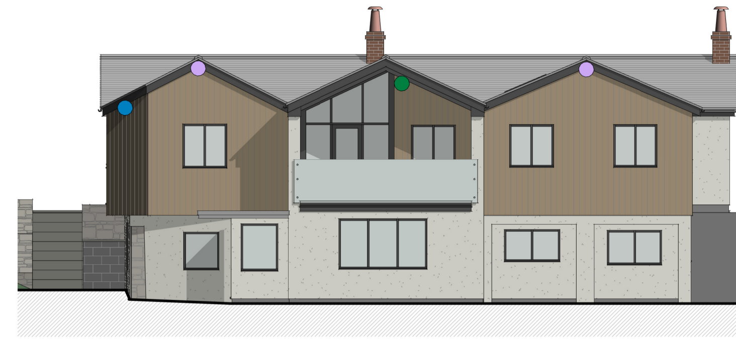
FRONT ELEVATION - North West - Scale 1:100