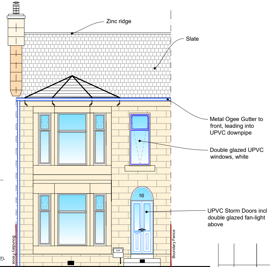
Front Elevation as Existing Scale: 1/100 @ A3