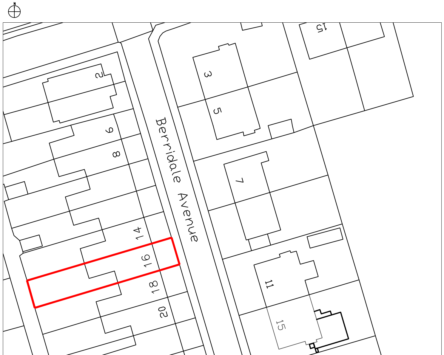
BLOCK PLAN 1/500 @ A3