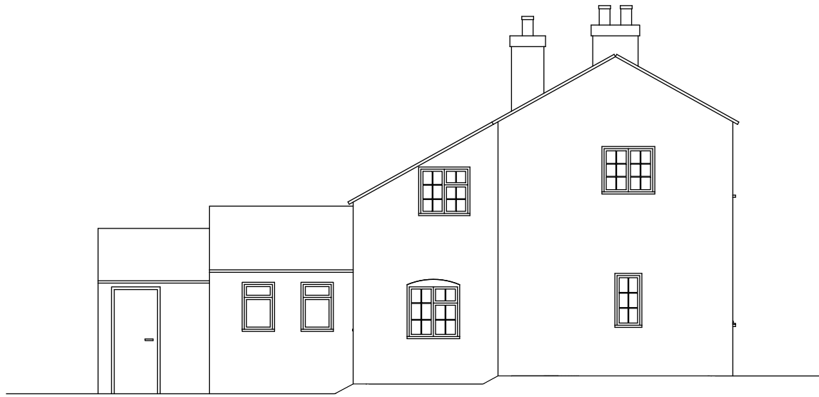
Side Elevation (West)