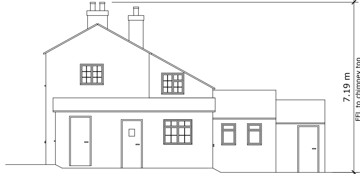
Side Elevation (East)