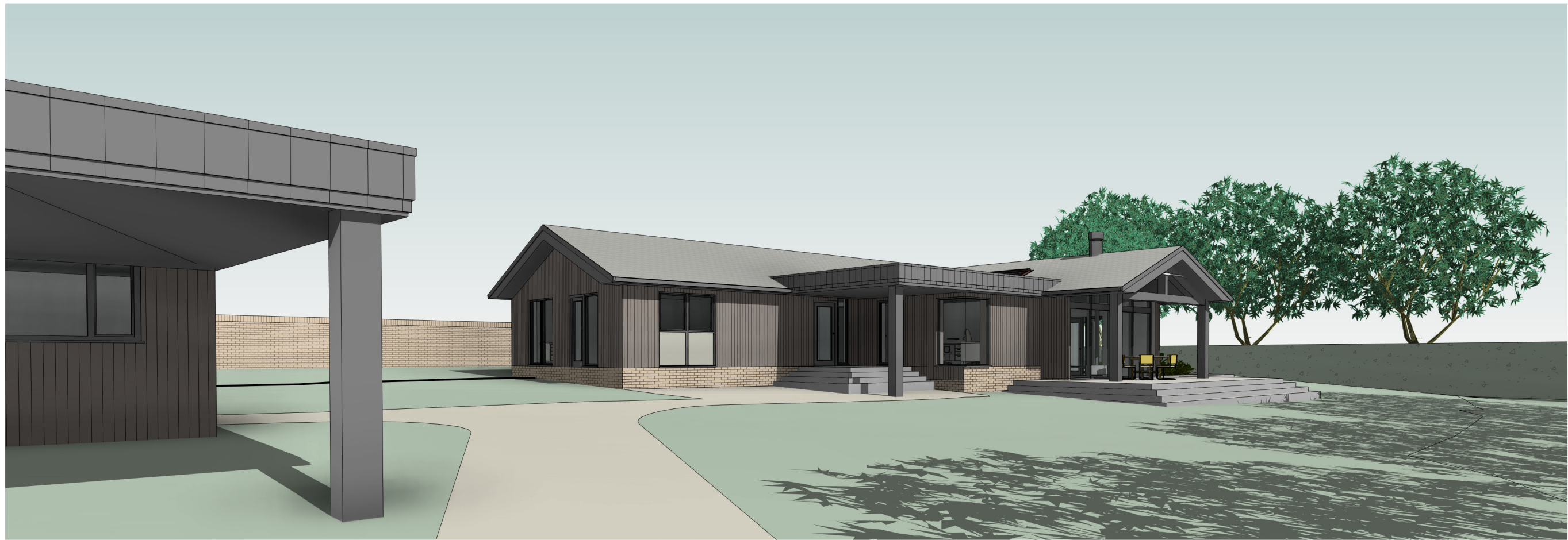
2 View Looking South