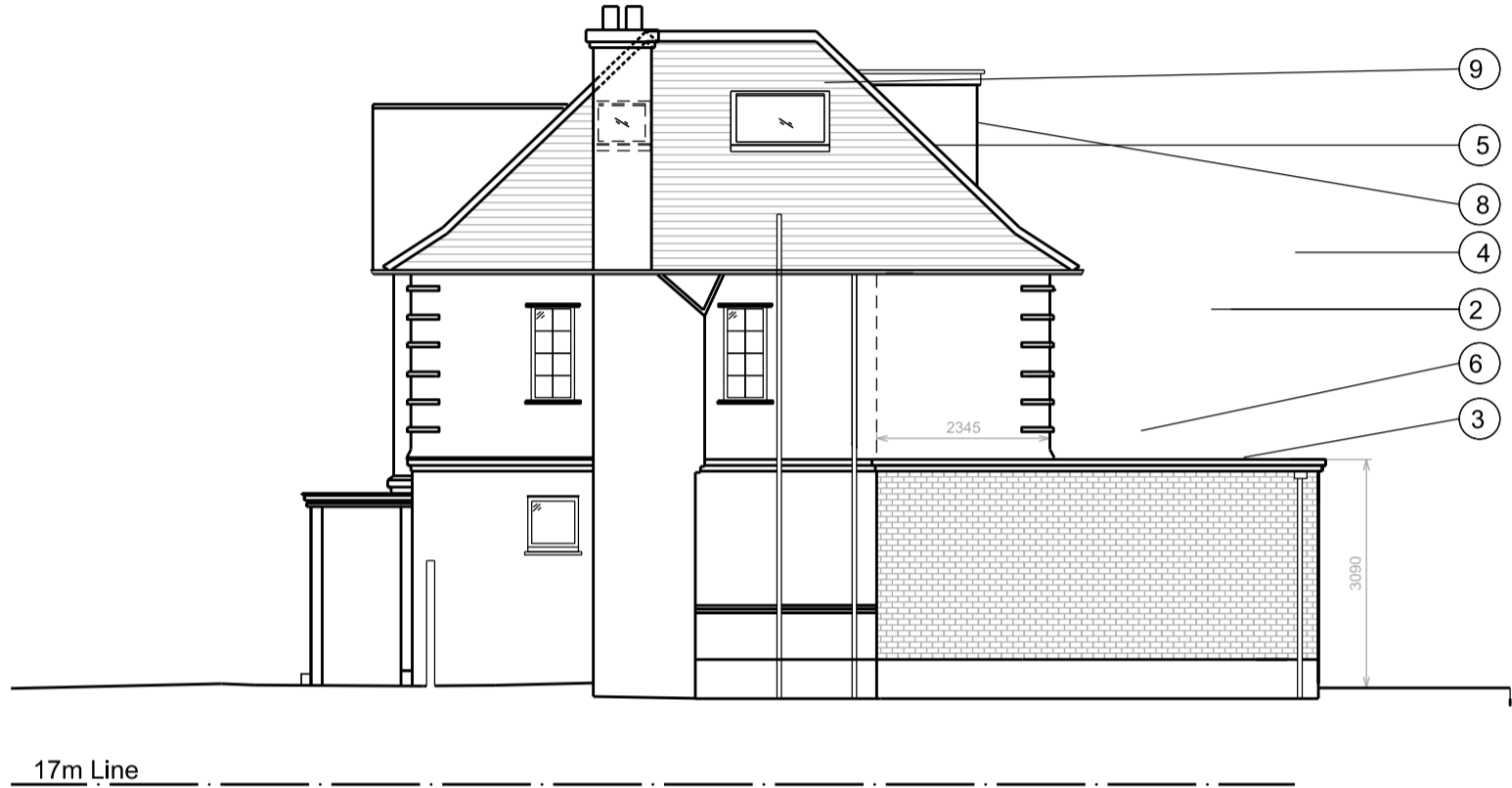
00 Proposed Right Elevation TR01 SCALE 1:100