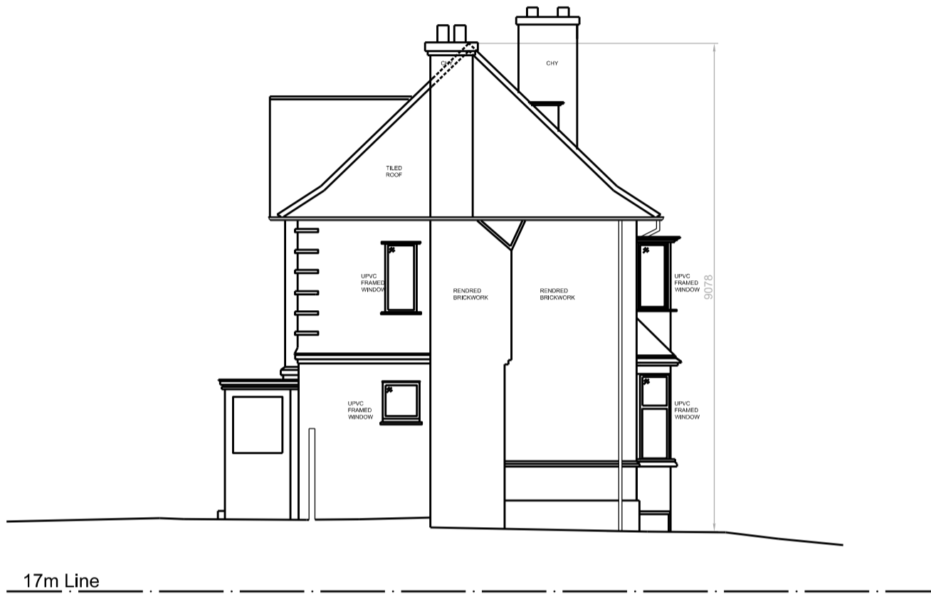
00 Existing Right Elevation TR01 SCALE 1:100