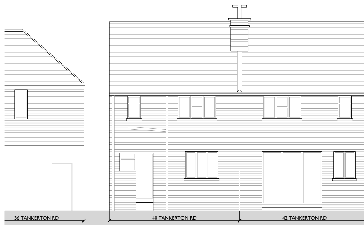
+EL Existing south elevation - scale 1:100 at A3 Scale in Metres 0 1 2 3 4 5