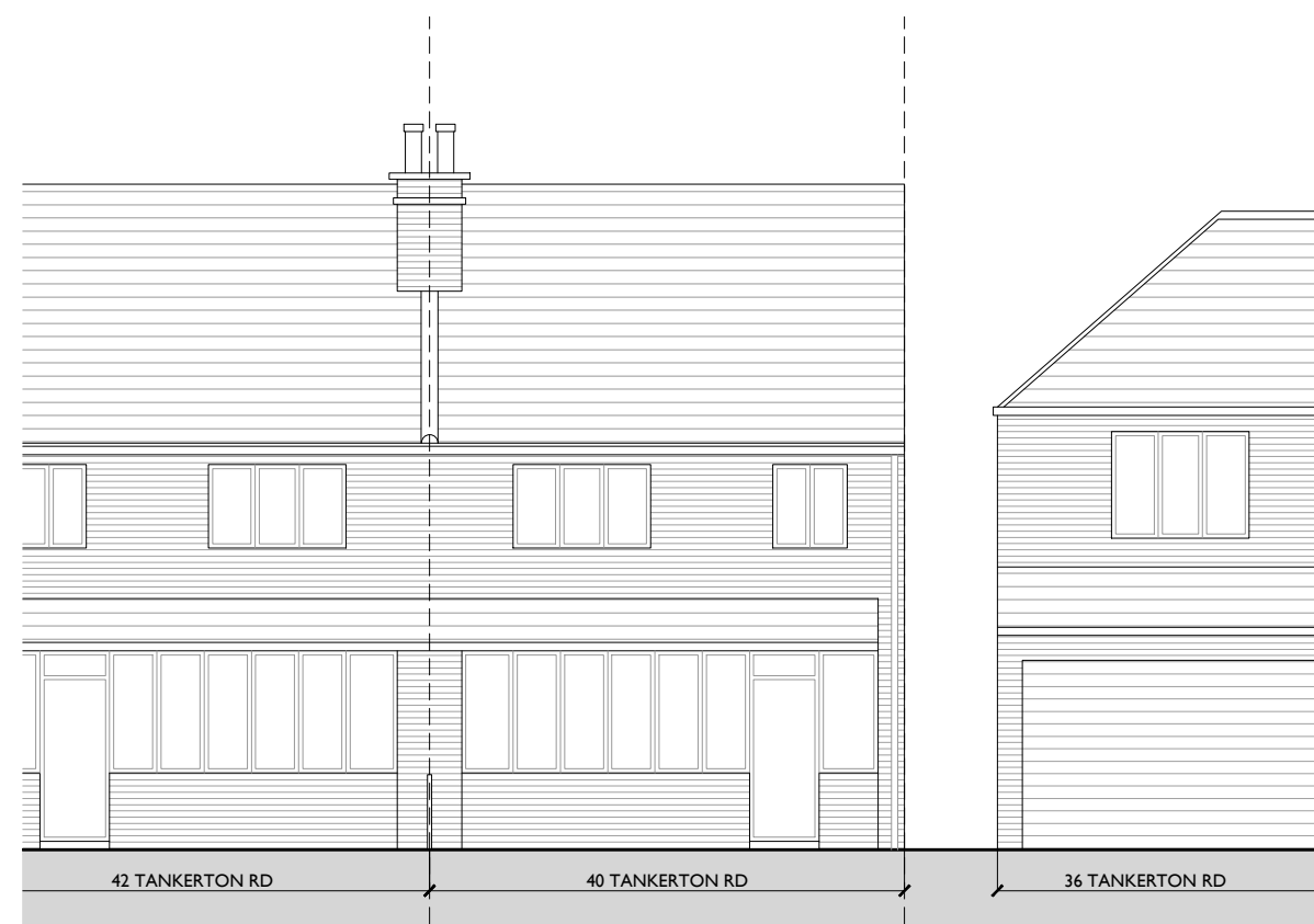
+EL Existing north elevation - scale 1:100 at A3 Scale in Metres 0 1 2 3 4 5