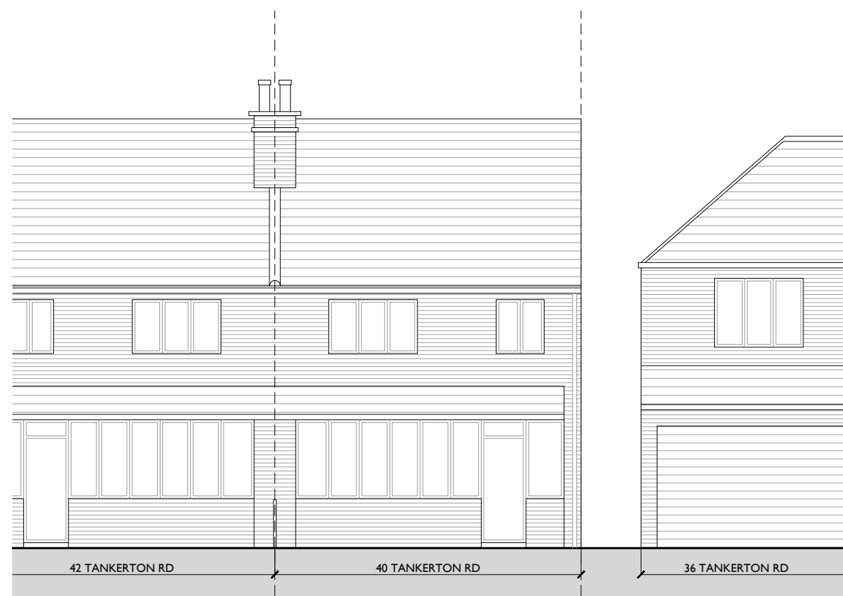
+EL Proposed north elevation - scale 1:100 at A3 Scale in Metres