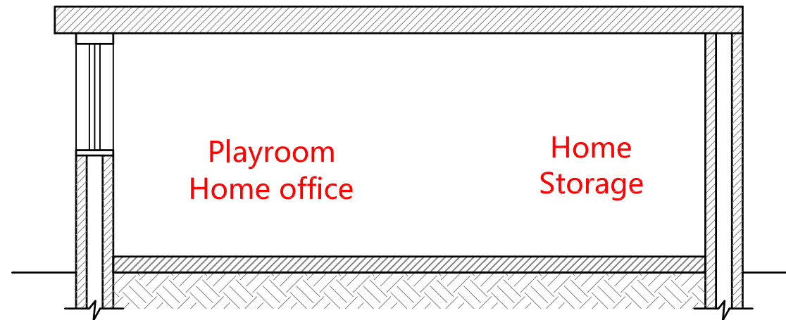
Proposed Section x-x