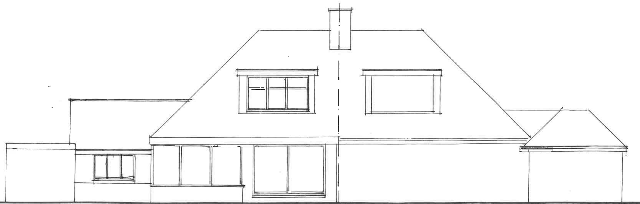
PROPOSED REAR (GARDEN) ELEVATION. [SOUTH EAST.]

EXISTING AND PROPOSED SIDE AND REAR ELEVATIONS. 53 VICTORIA AVENUE WEST SR 2 9PQ 1/100. 53/05.