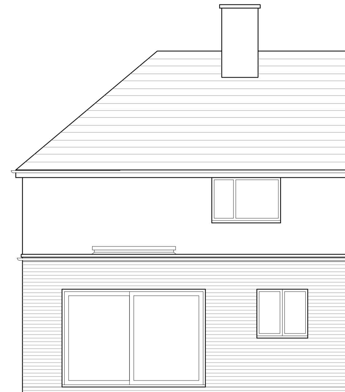
03 REAR ELEVATION AS PROPOSED 1:50