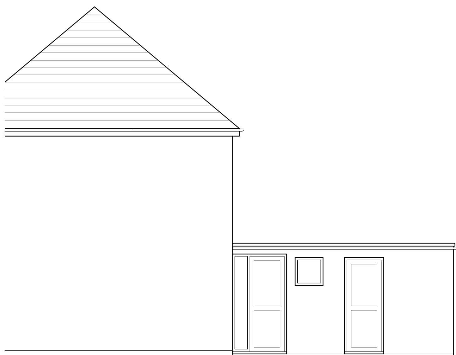
02 SIDE ELEVATION AS EXISTING 1:50