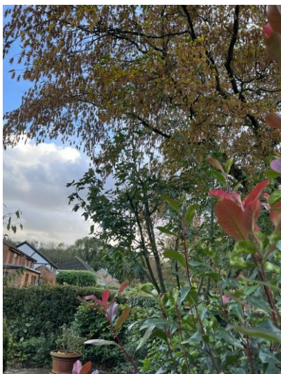
View along boundary fence from North