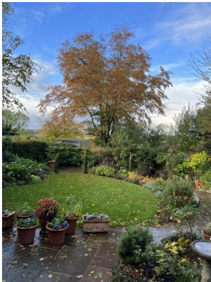
View from rear of No24 Cobblestones