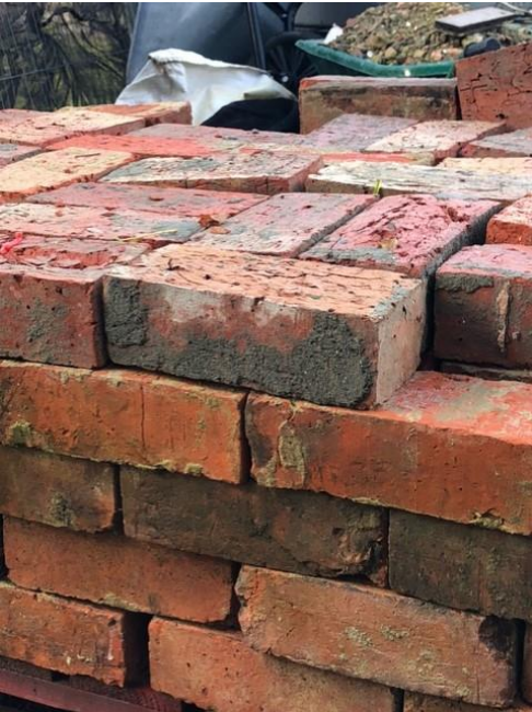
Sample bricks (Photo 4)