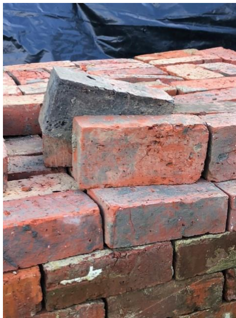
Sample bricks (Photo 5)