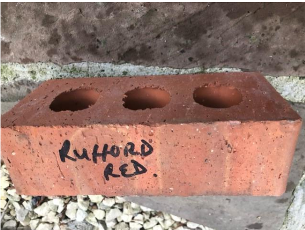
Sample bricks (Photo 6)