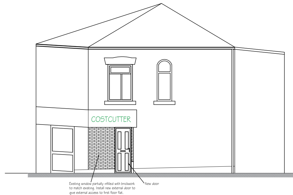
PROPOSED HONEYWELL LANE ELEVATION 1:100