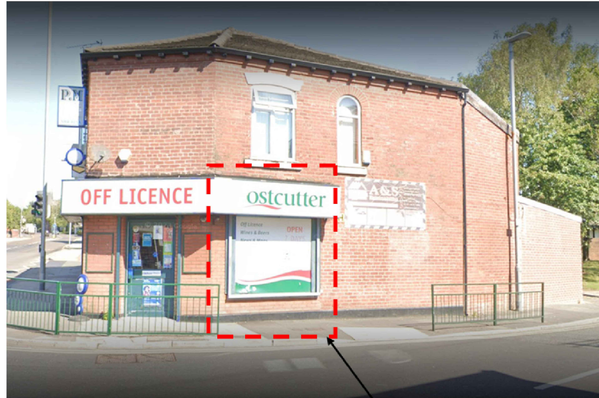
Existing window partially bricked up and new external door installed