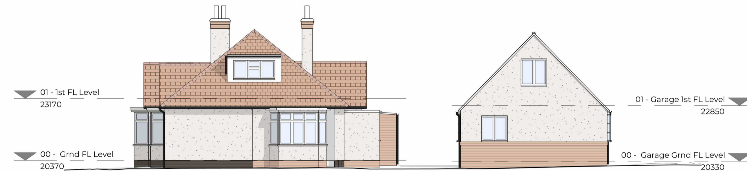
Existing East Elevation 1:100