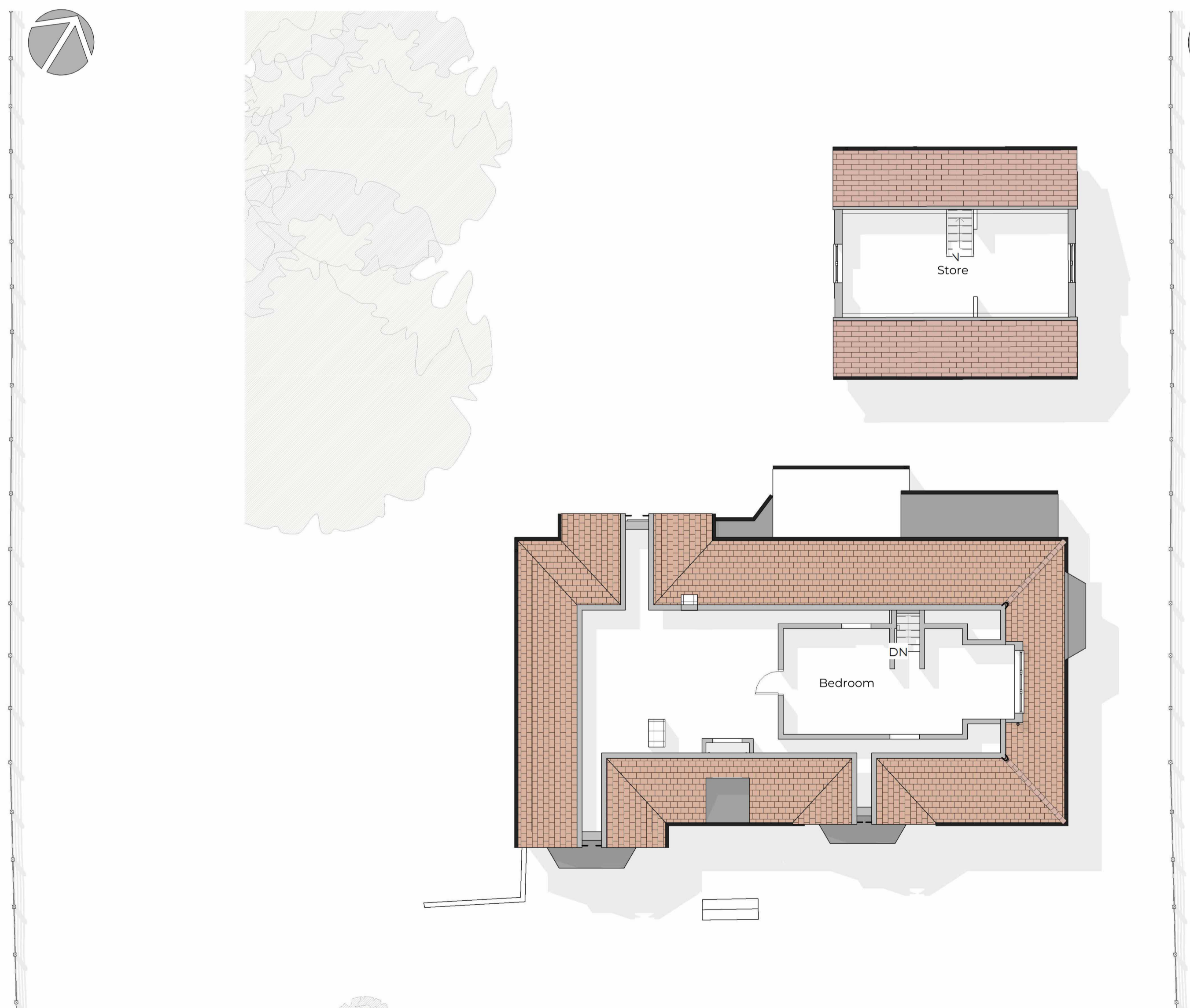
Existing First Floor Plans 1:100