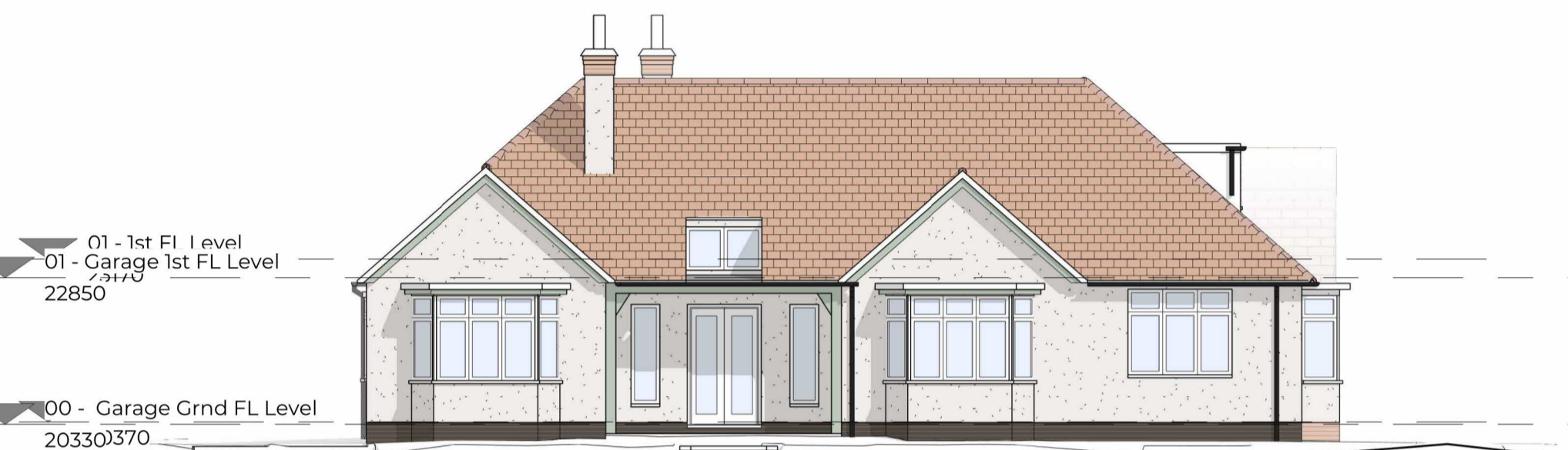
Existing South Elevation 1:100