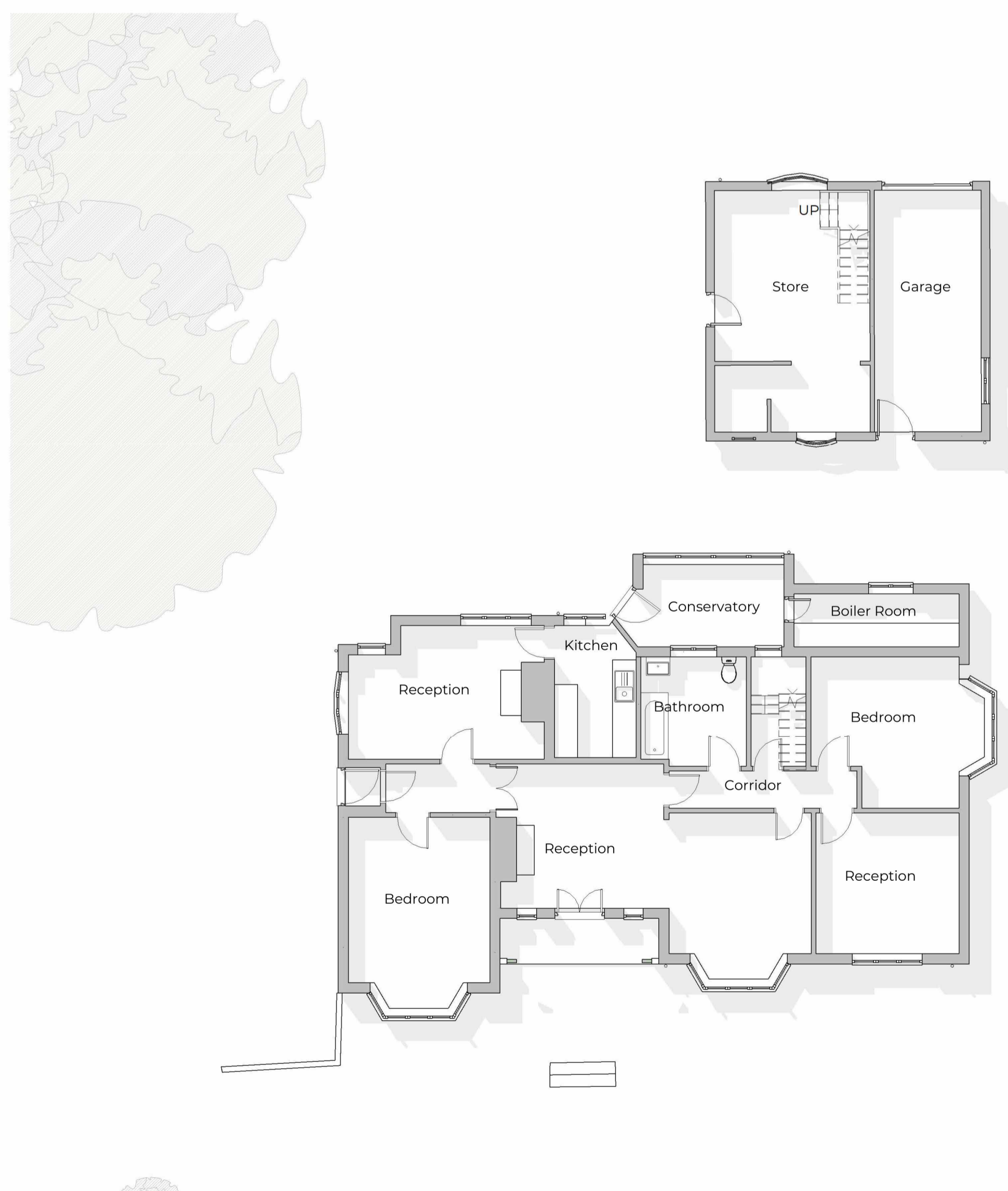
Existing Ground Floor Plans 1:100