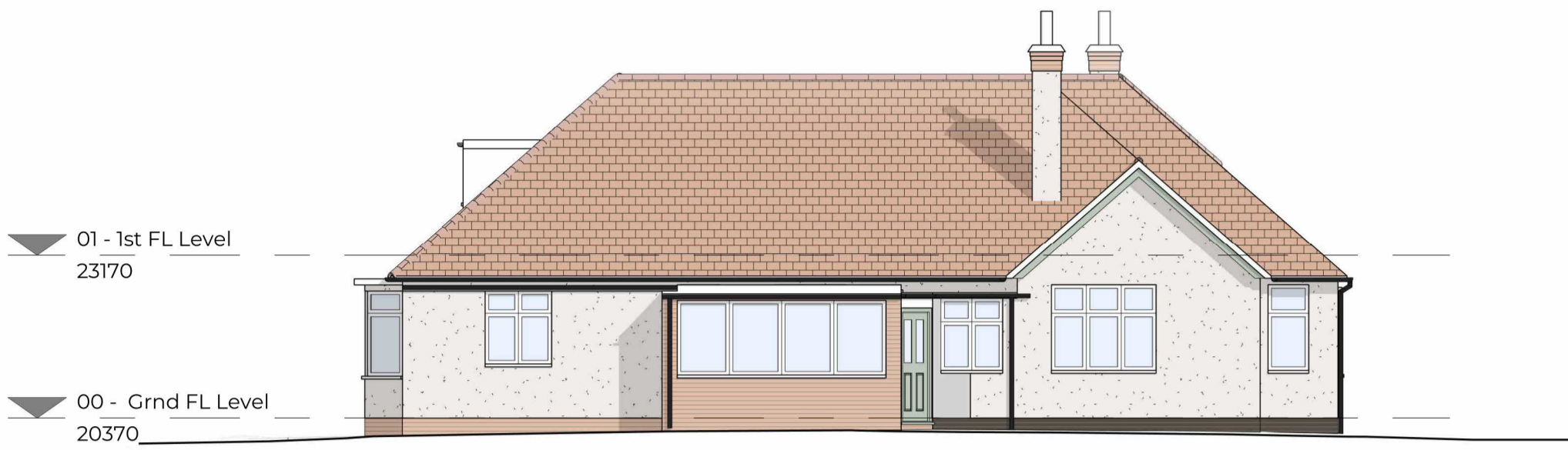
Existing North Elevation 1:100