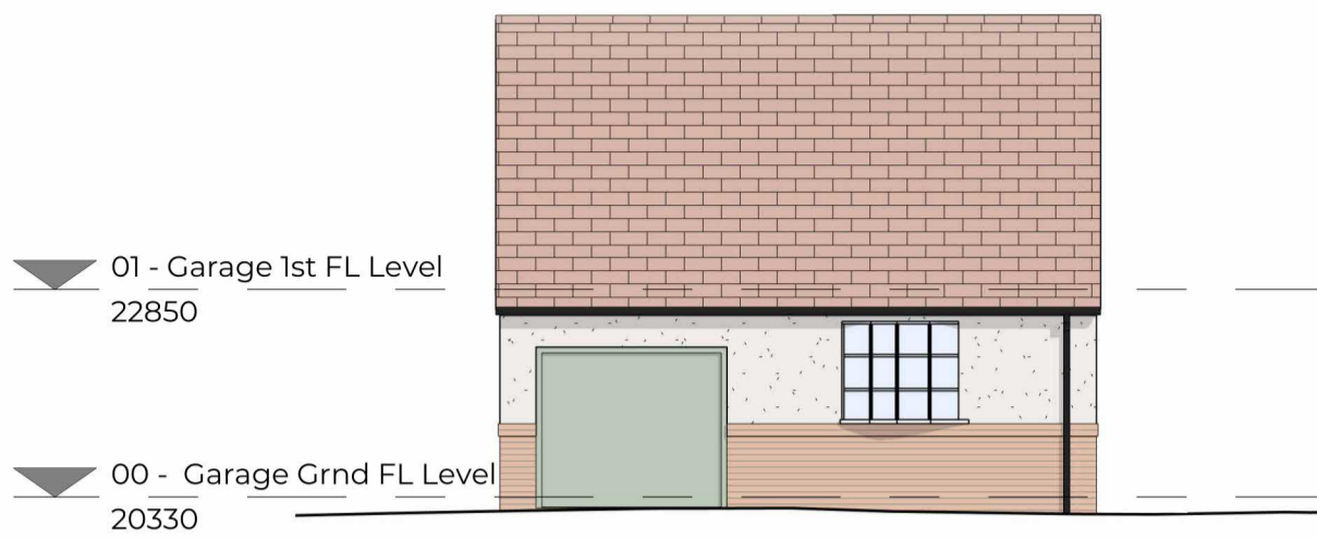
Existing North Elevation (Garage) 1:100