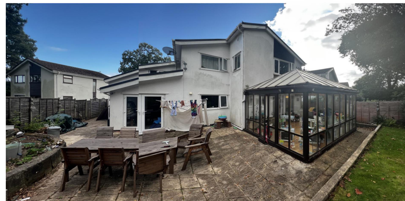
EXISTING HOUSE ELEVATION - REAR TO GARDEN

Location Plan shows area bounded by: 318218.28, 183569.9 318359.71, 183711.32 (at a scale of 1:1250), OSGridRef: ST18288364. The representation of a road, track or path is no evidence of a right of way. The representation of features as lines is no evidence of a property boundary.