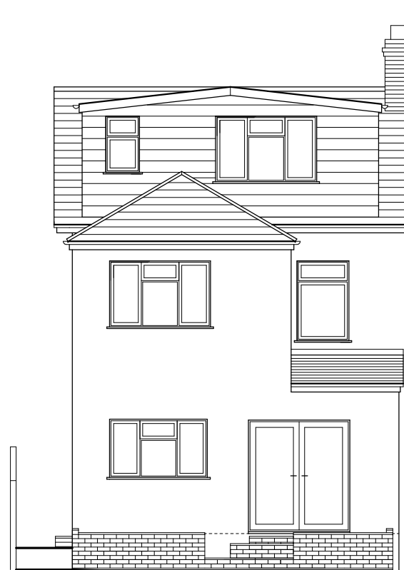
proposed rear elevation