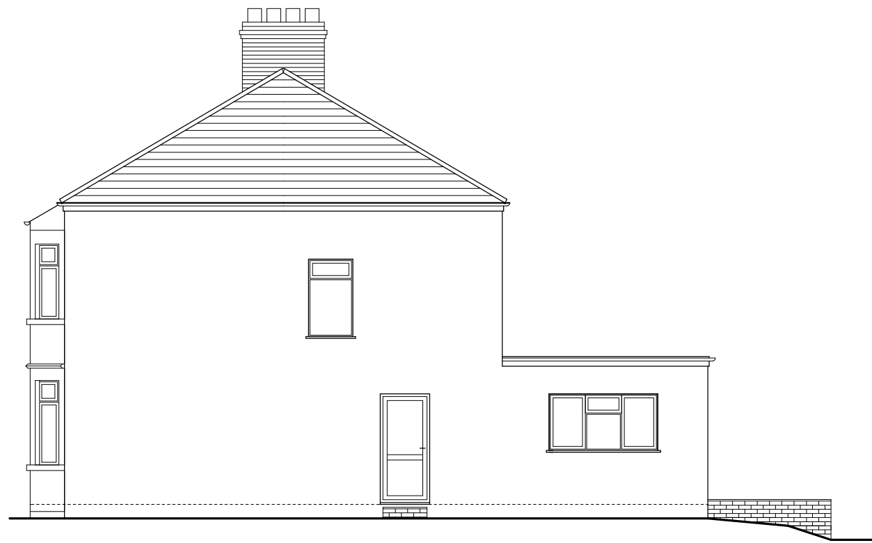
existing side elevation (right)