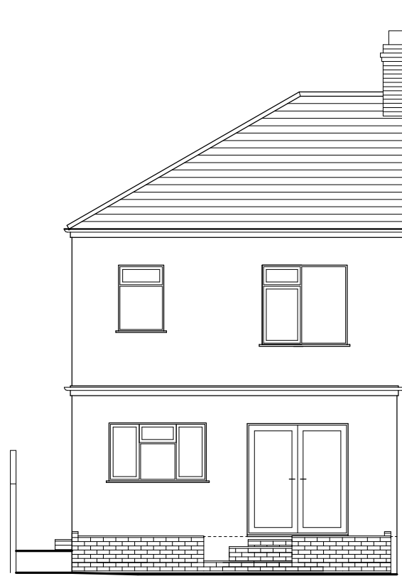
existing rear elevation