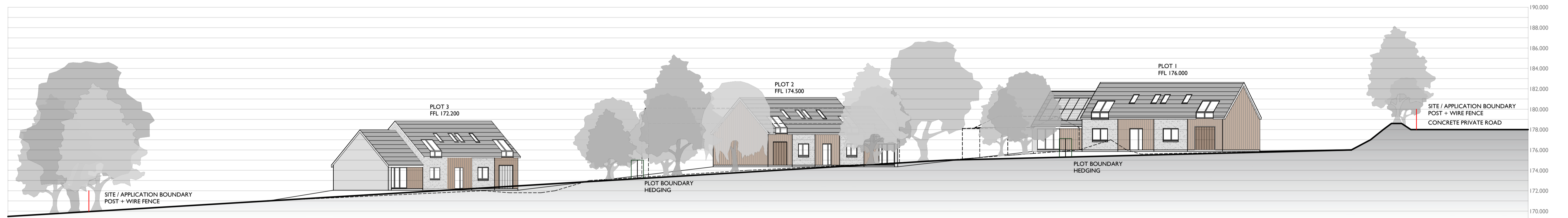
PROPOSED SITE SECTION Y-Y 1:200