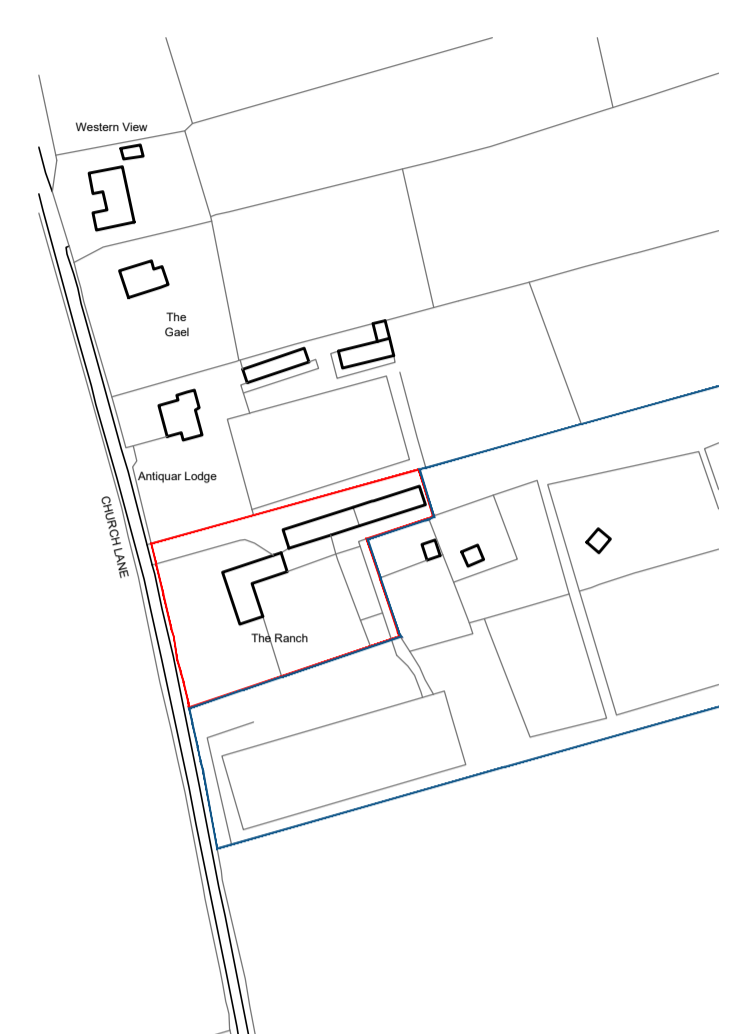
LOCATION PLAN SCALE: 1:2000@A1