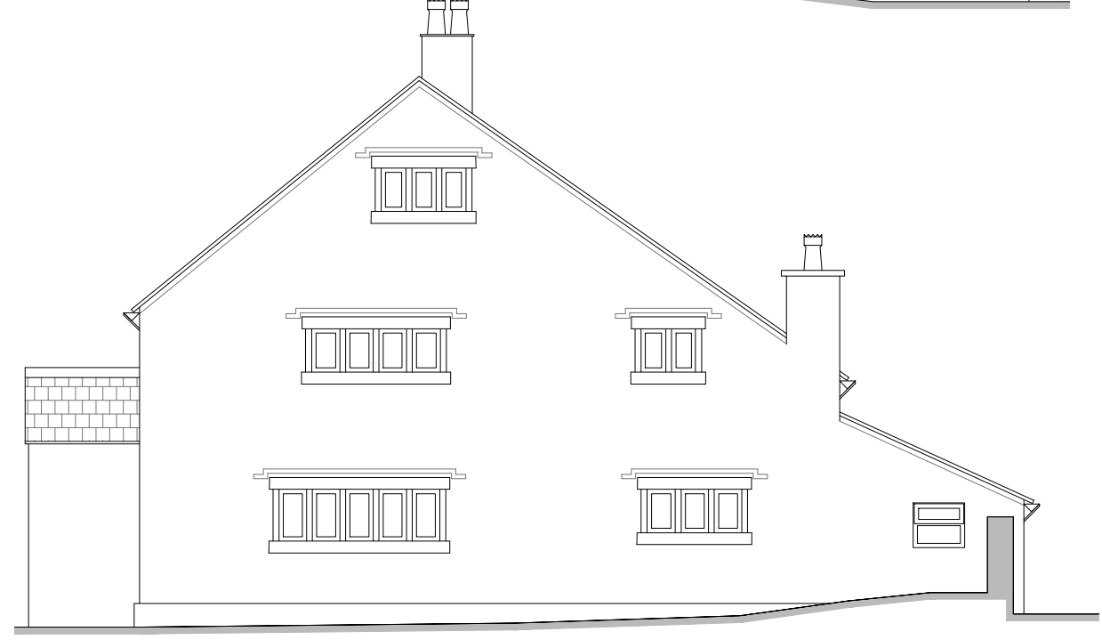
Existing and Proposed Side Elevation Scale 1:100