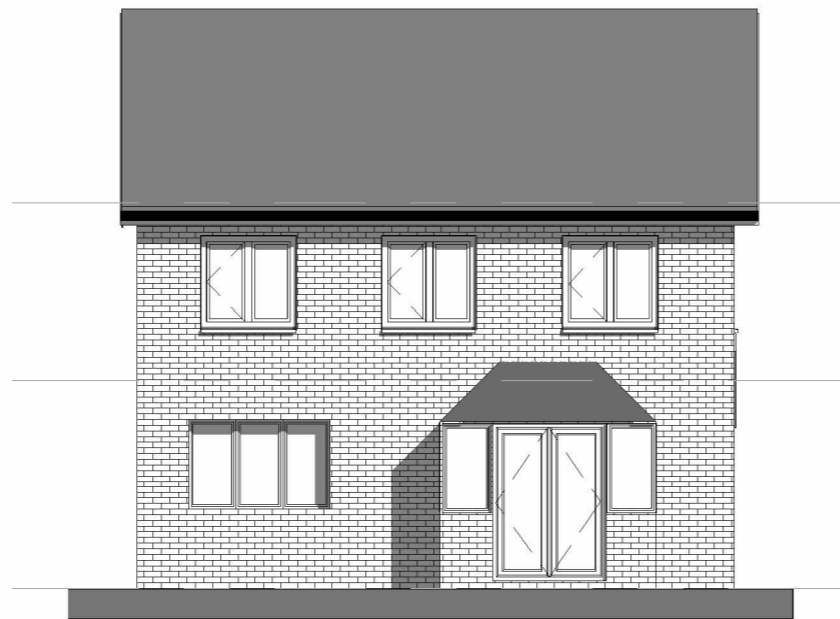
EXISTING & PROPOSED WEST ELEVATION 1:100