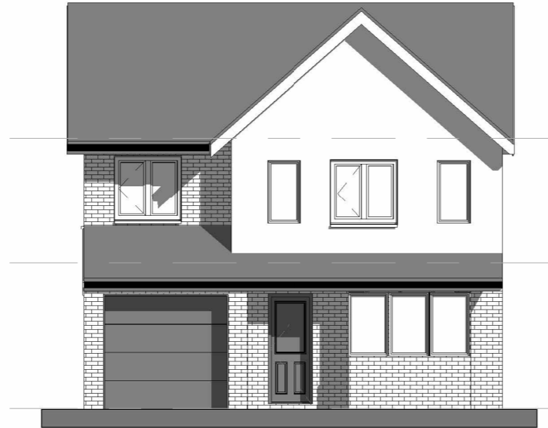
EXISTING & PROPOSED EAST ELEVATION 1:100