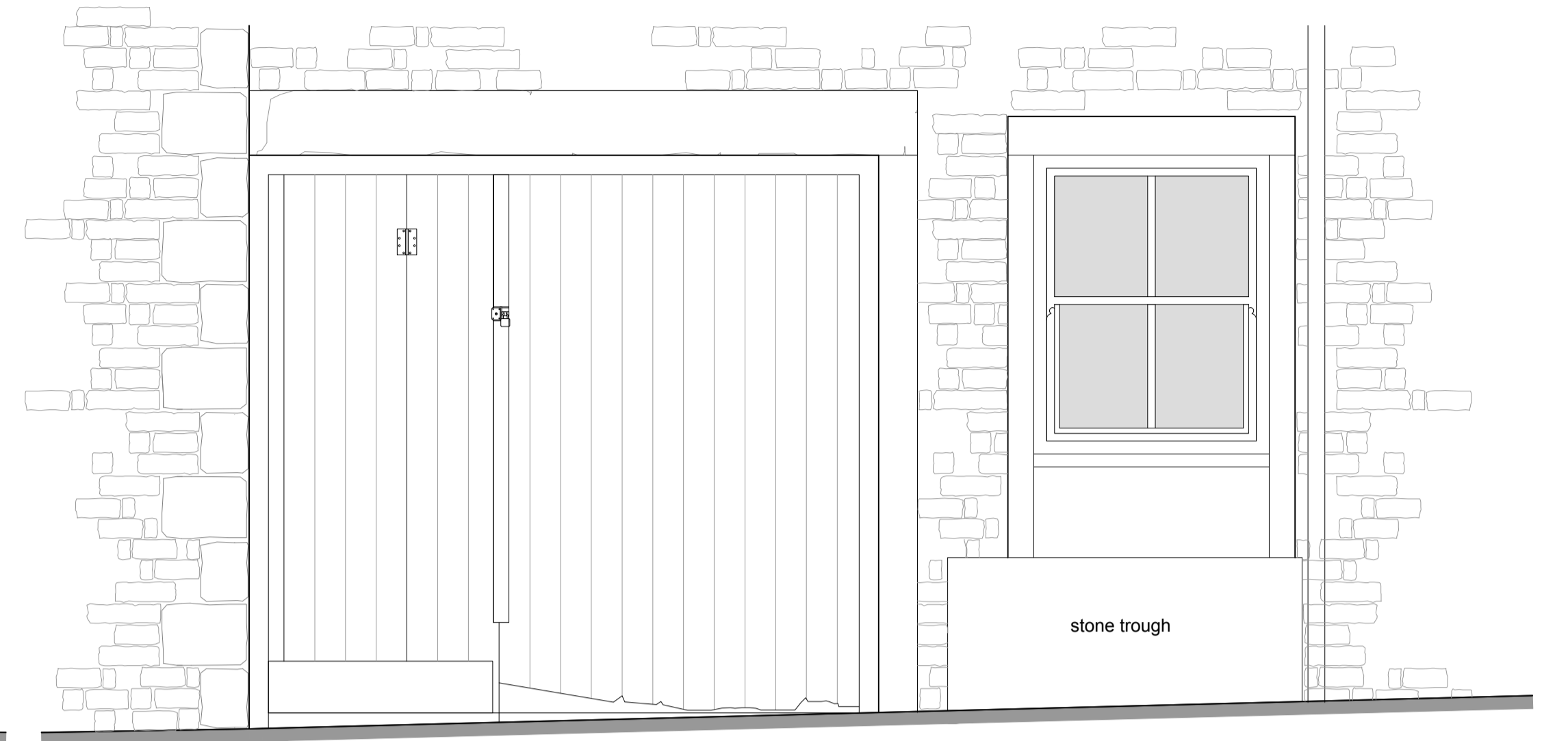
DOOR TO WEST ELEVATION (As Existing)