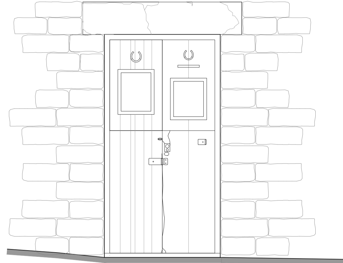
DOOR TO NORTH ELEVATION (As Existing)