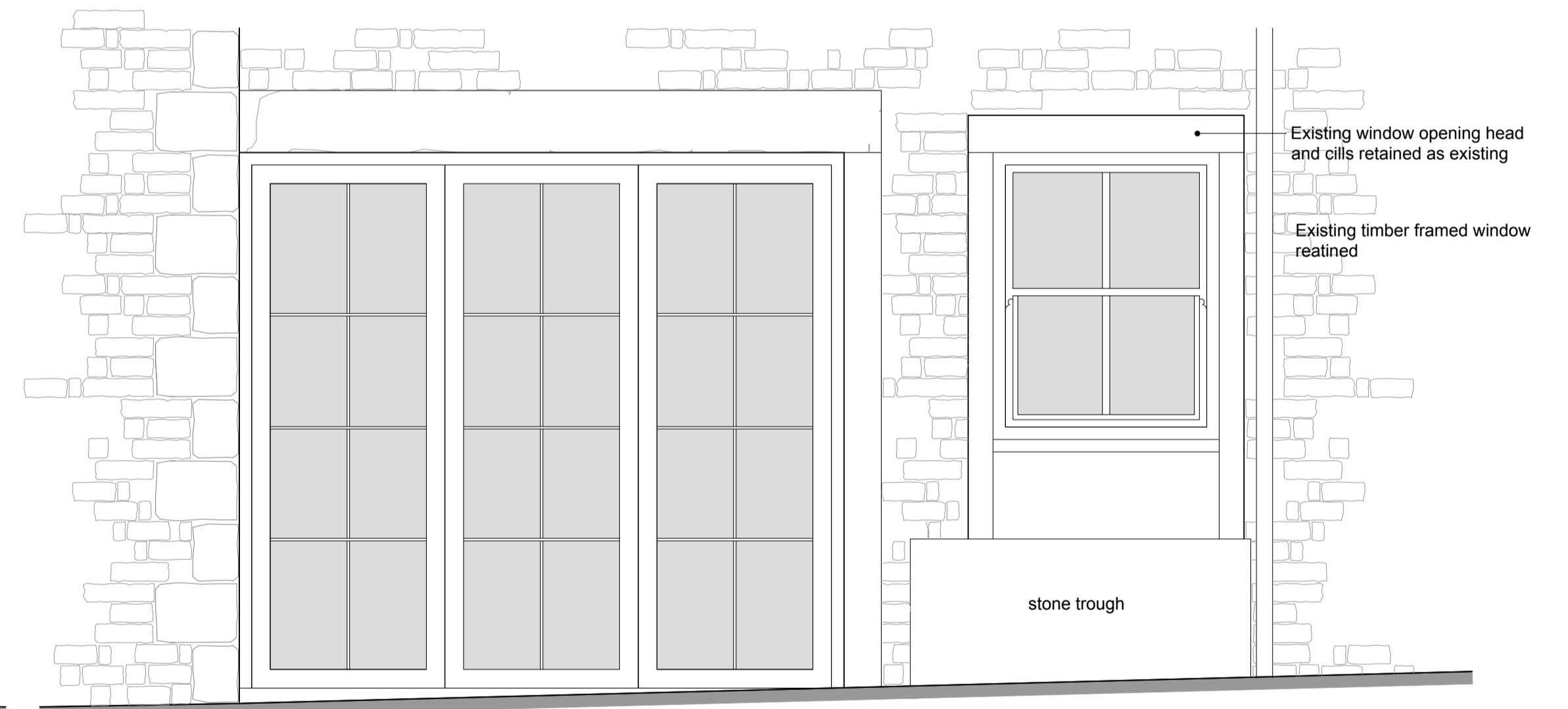
DOOR TO WEST ELEVATION (As Proposed)

new timber framed door to existing opening