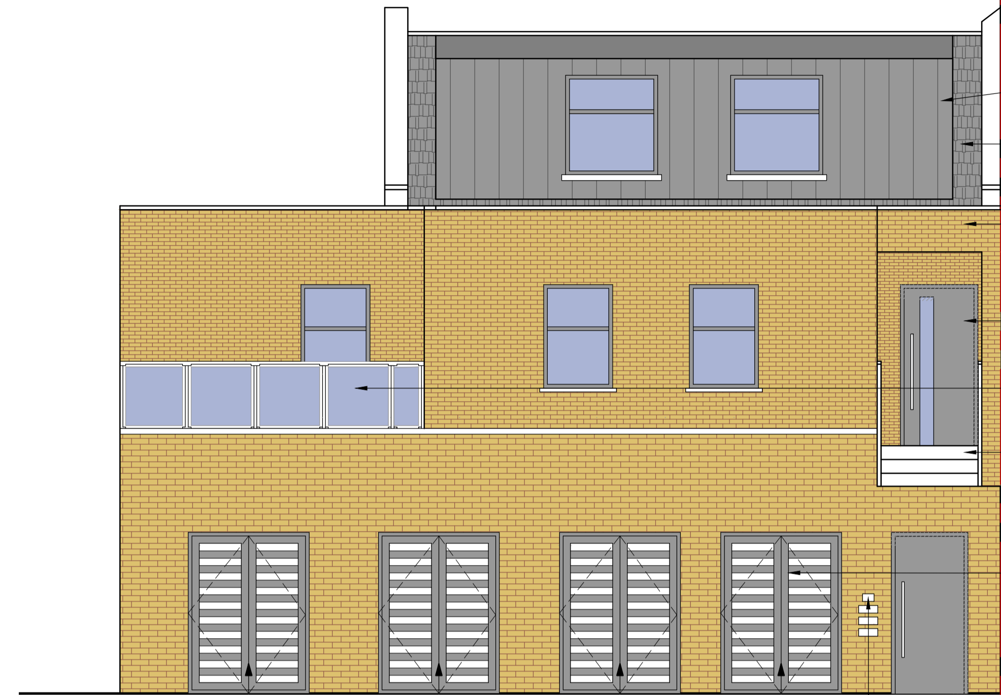
PROPOSED REAR ELEVATION ALL NEIGHBORING PROPERTIES ARE INDICATIVE ONLY