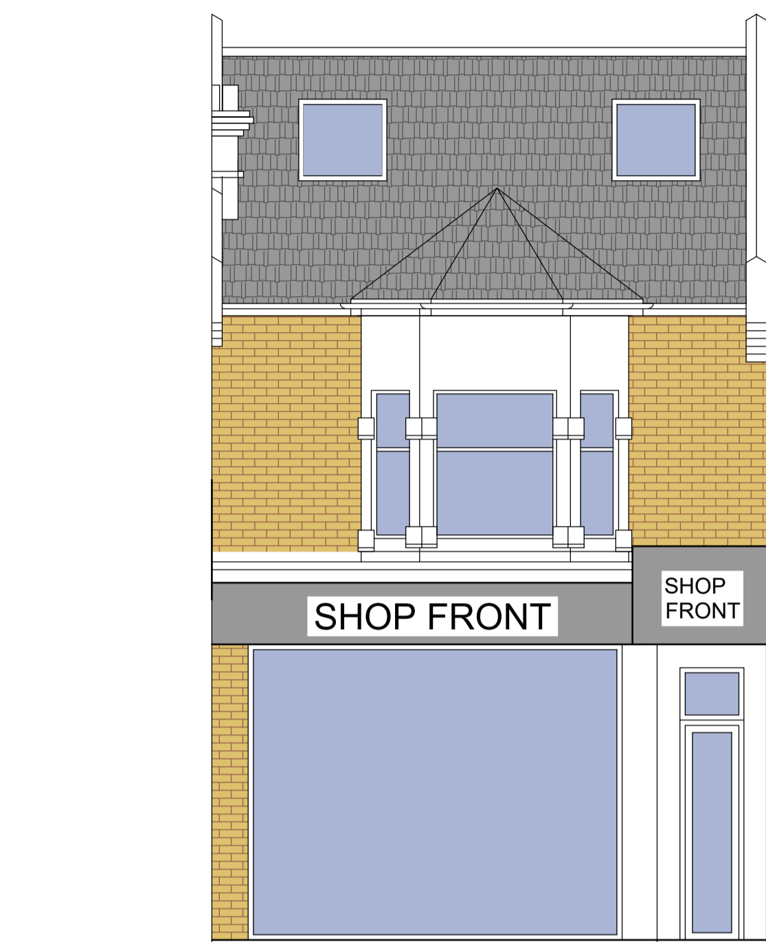
PROPOSED FRONT ELEVATION ALL NEIGHBORING PROPERTIES ARE INDICATIVE ONLY

Architorium has prepared these drawings based on the previous Architects drawings provided by the client. Architorium will not take any liability of the discrepancies in these drawings. Setting out engineer must be called on site to set out the building. Any discrepancy must be reported back to us before ordering materials and commencement of works on site.