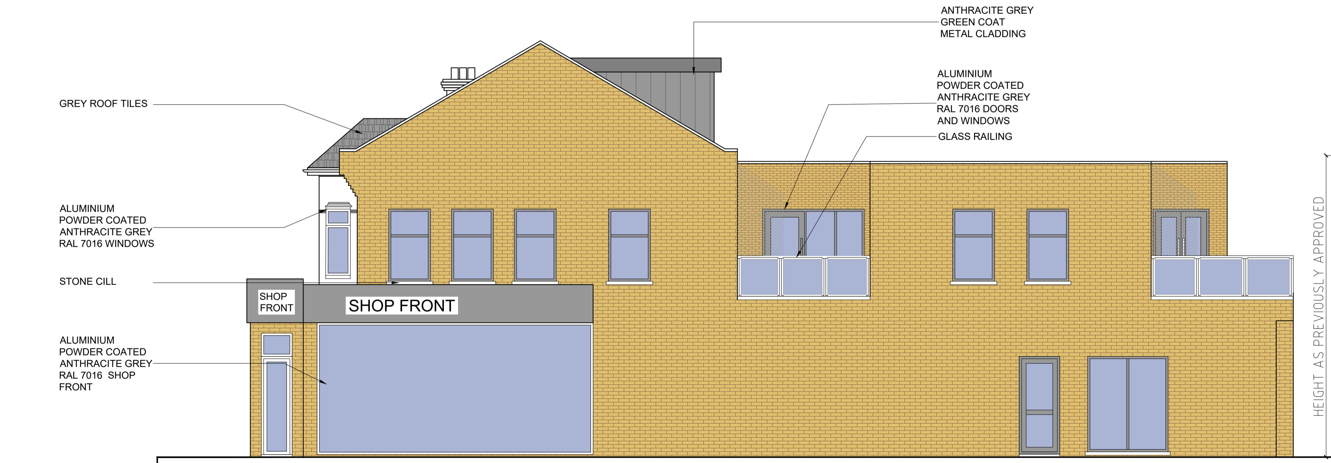
PROPOSED SIDE ELEVATION ALL NEIGHBORING PROPERTIES ARE INDICATIVE ONLY

CYCLE STORAGE COMMERCIAL BIN STORAGE RESIDENTIAL BIN STORAGE CYCLE STORAGE VIDEO ENTRY SYSTEM & LETTER BOX