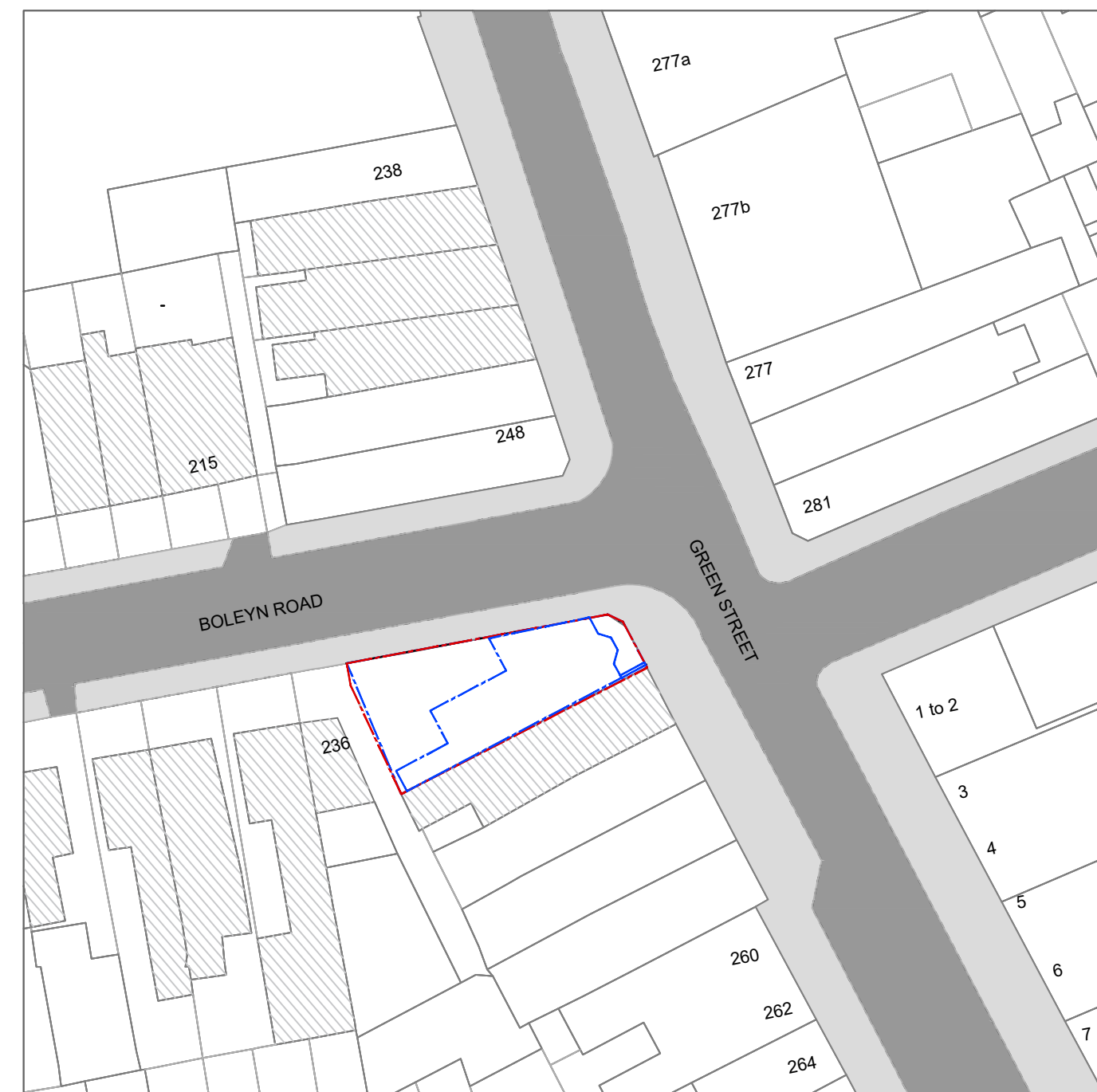
EXISTING BLOCK PLAN SCALE - 1:500