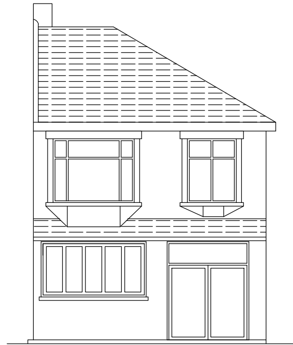
EXISTING FRONT ELEVATION SCALE : 1 : 1 0 0