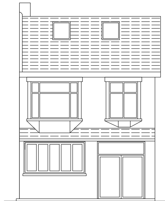
PROPOSED FRONT ELEVATION SCALE : 1 : 1 0 0