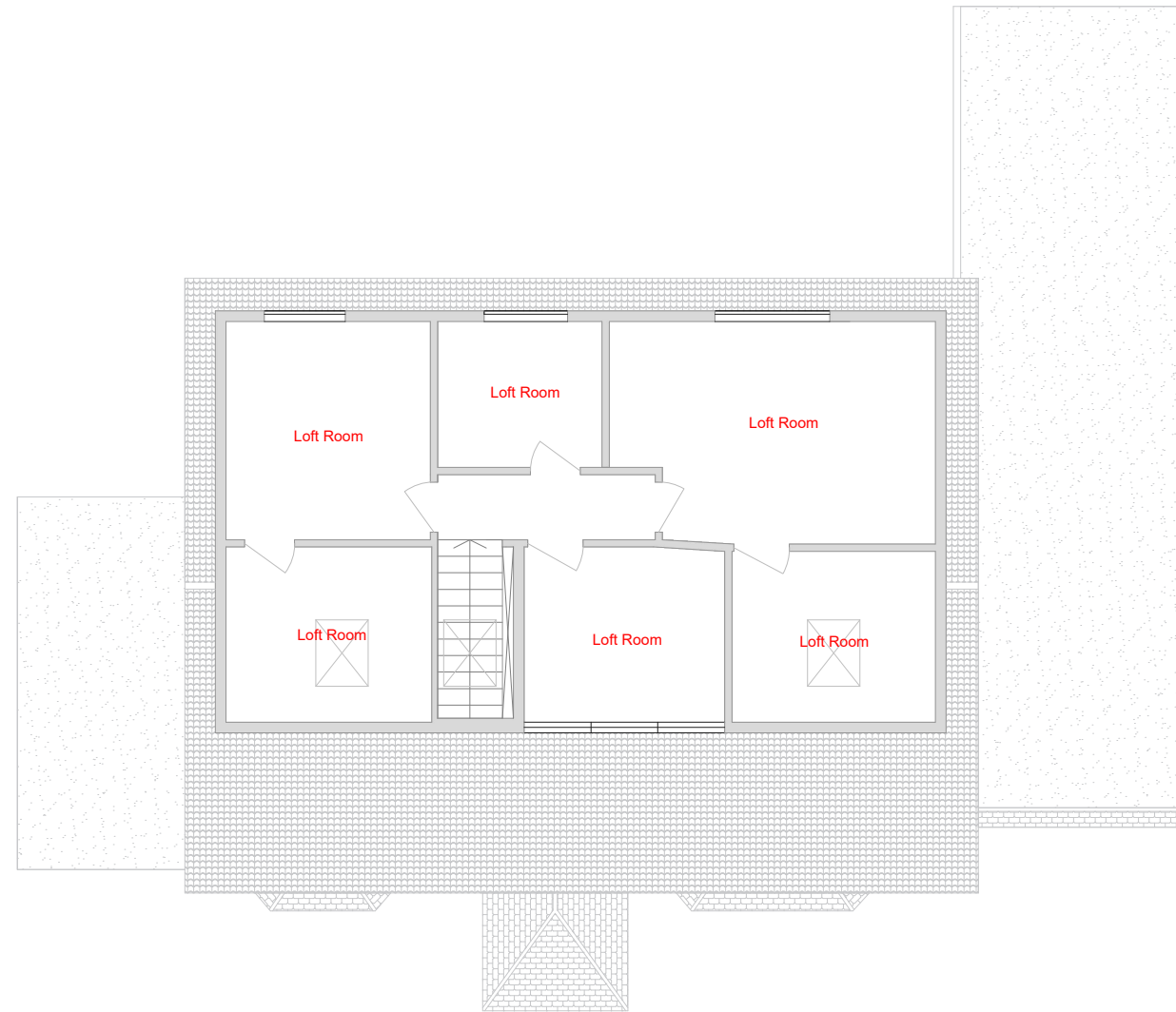
Existing Loft floor plan 1:100