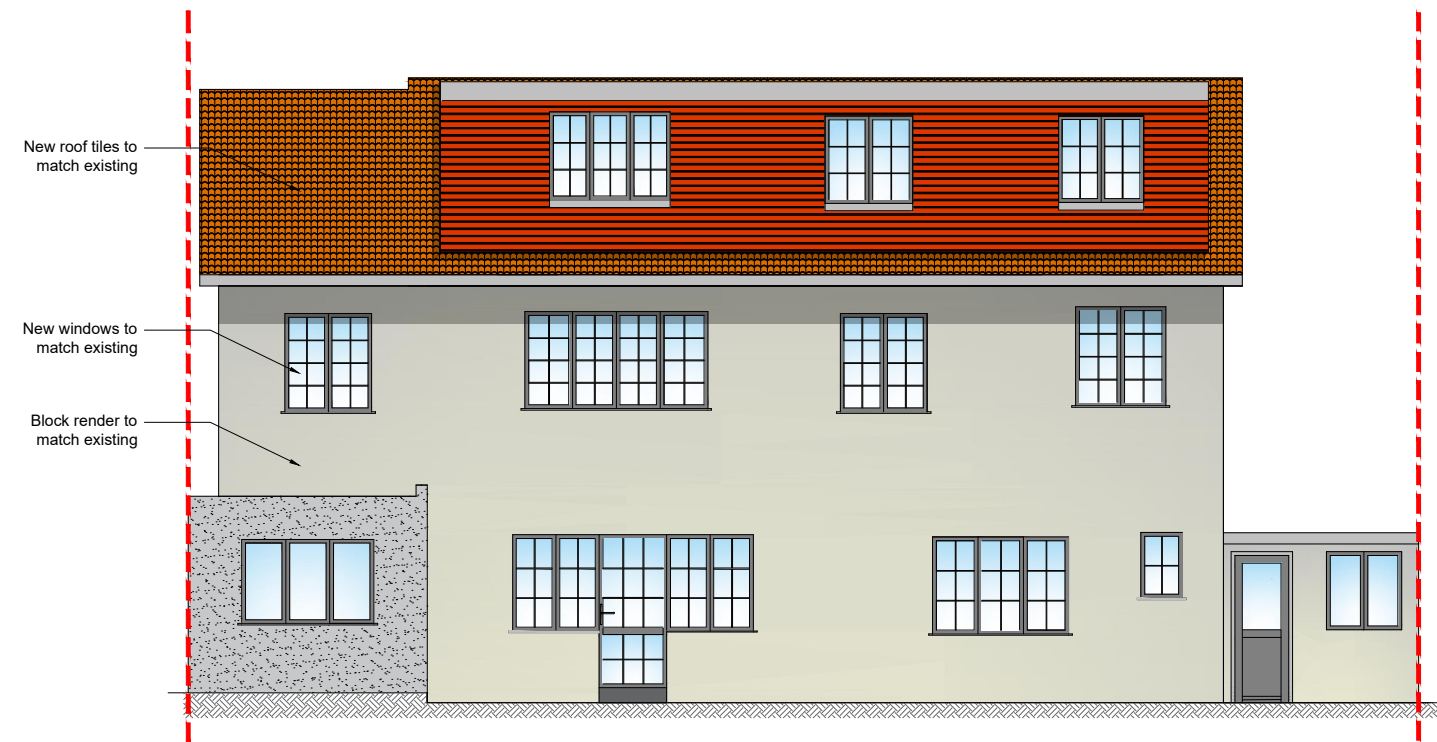
Proposed rear elevation 1:100

CGA DESIGN + BUILD ARCHITECTURAL SERVICES