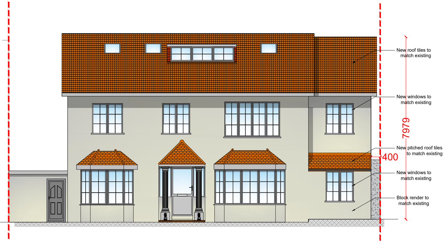
Proposed front elevation 1:100

Notes: 1) All Dimensions to be checked on site. 2) All works to comply with the current building regulations 3) All works may be subject to revision on site. 4) All drawings are the copyright of CGA Design & Build 5) This drawing may not be copied without prior permission. 6) All dimensions are in millimeters unless otherwise stated.