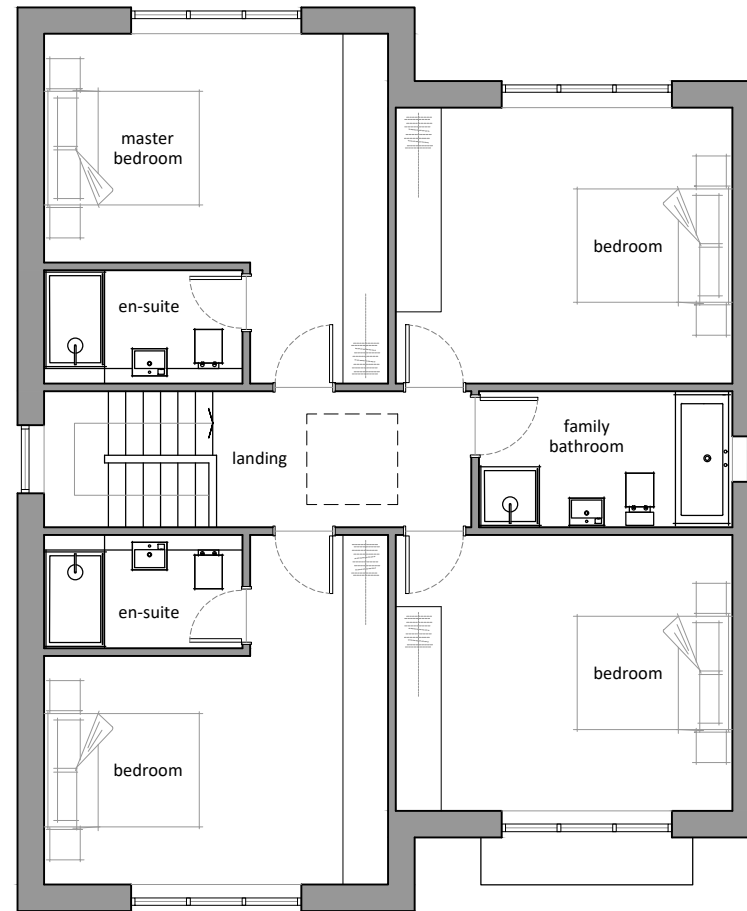
First Floor Plan 1:100