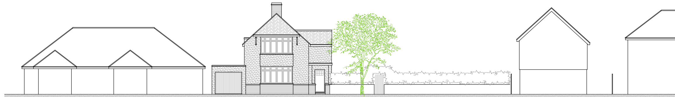
Existing Street Scene Elevation