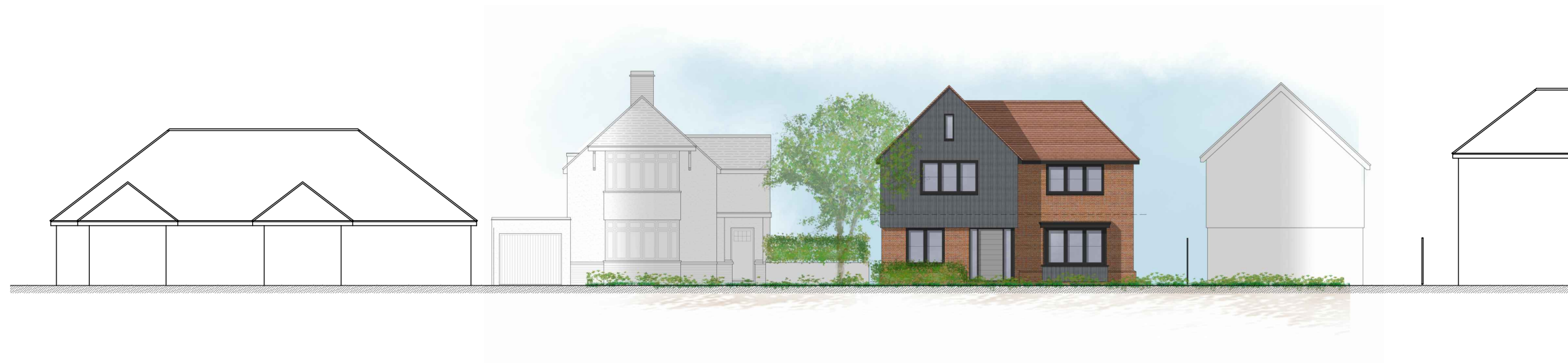
Proposed Street Scene Elevation