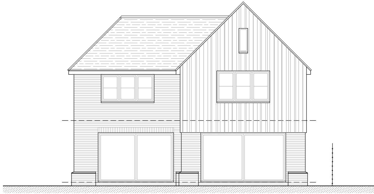
Rear (South-East) Elevation 1:100