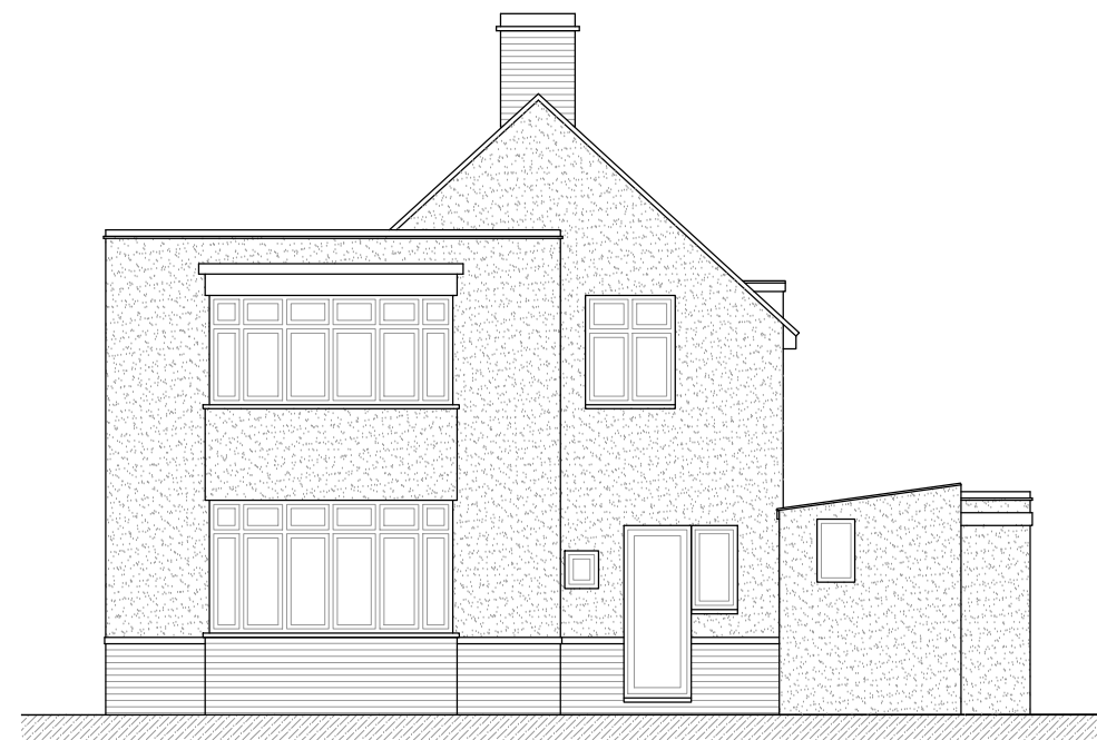
Rear (South-East) Elevation 1:100

Land adjacent to 28 St. Mildreds Avenue, Birchington