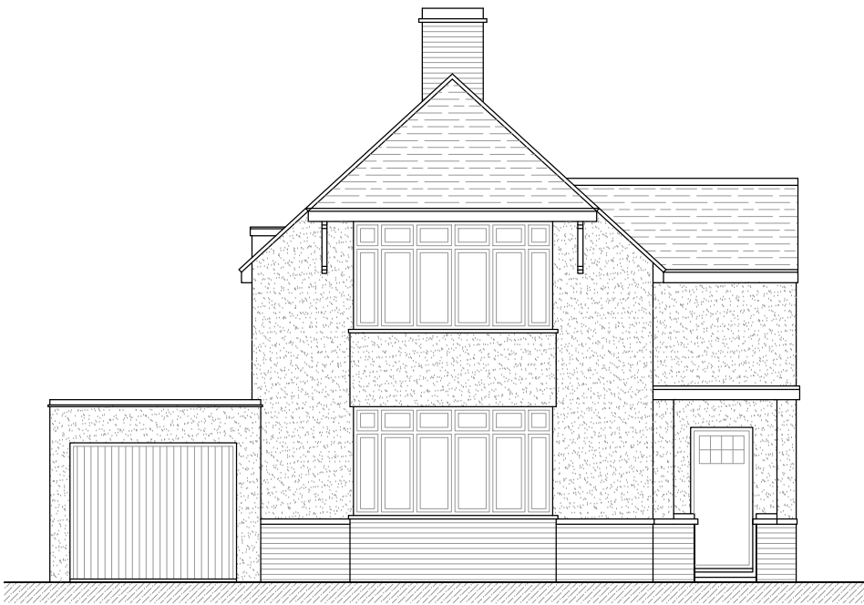
Front (North-West) Elevation 1:100