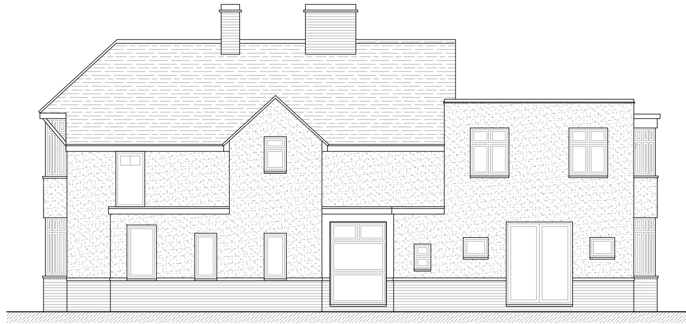
Side (South-West) Elevation 1:100