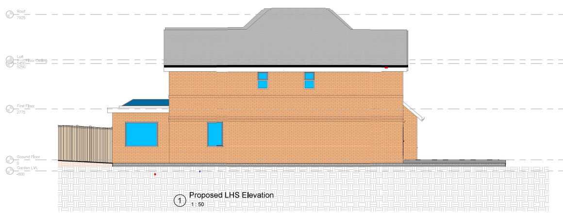
① Proposed LHS Elevation 1 : 50