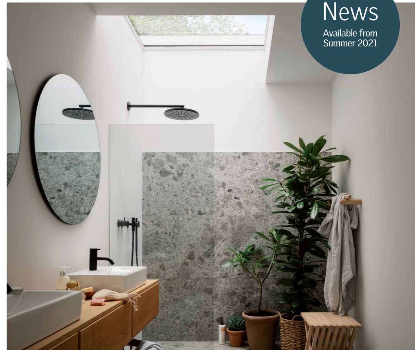
Flat roof windows