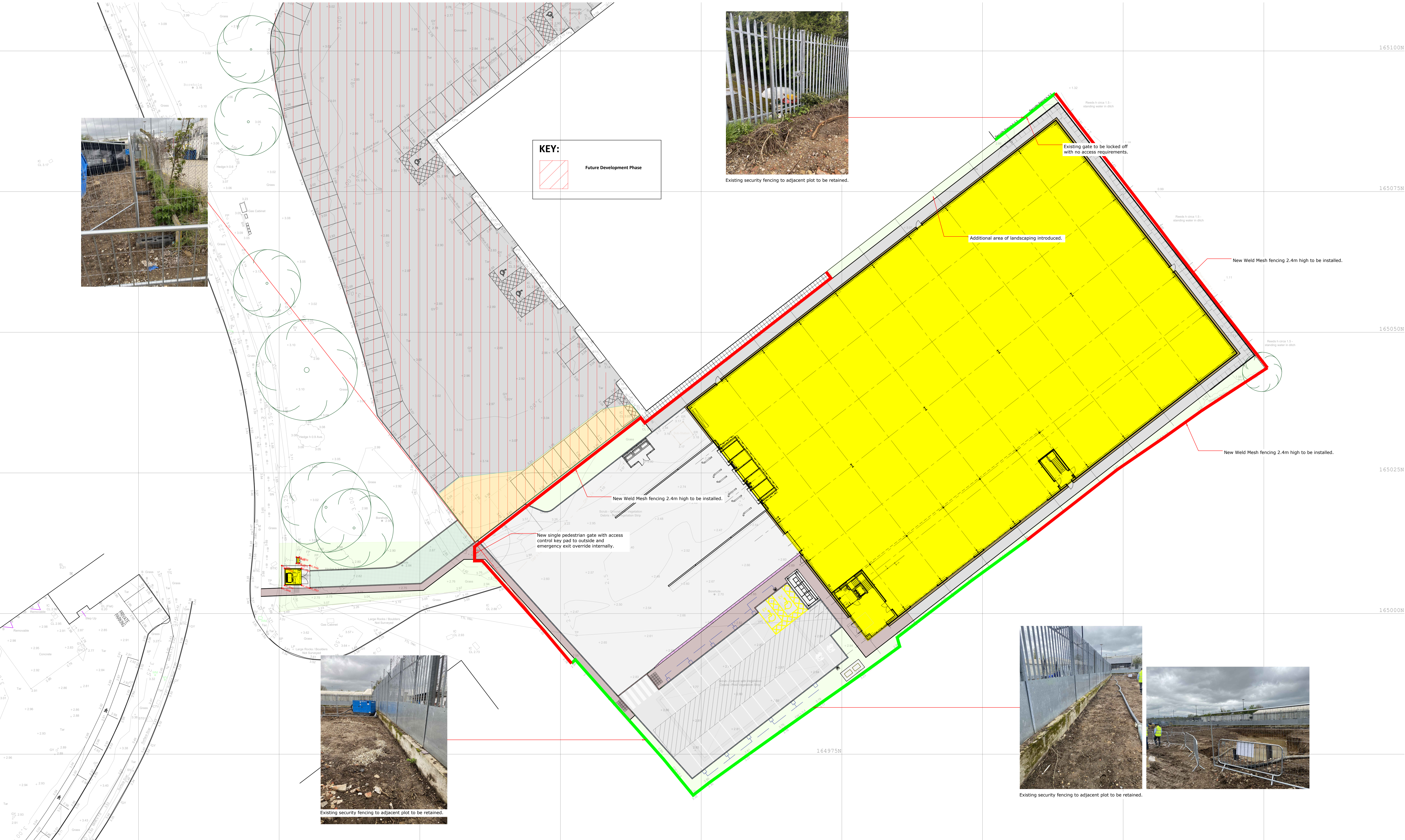
Proposed Site Plan Scale 1:250 @ A0