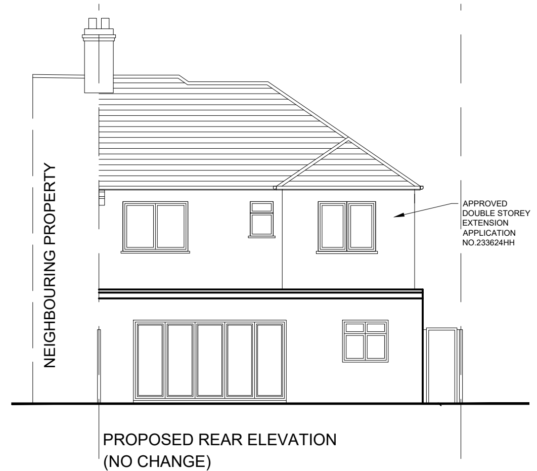
PROPOSED REAR ELEVATION (NO CHANGE)